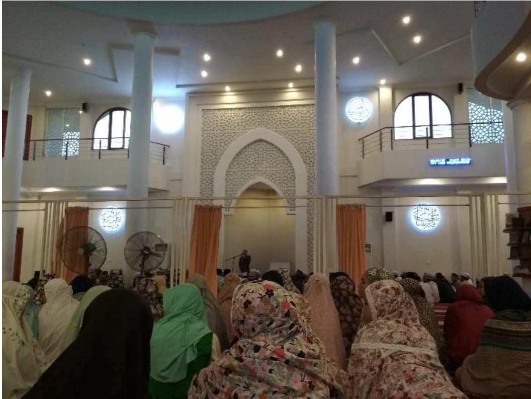
Language Court activity