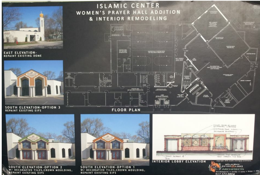
Figure 4. Photograph: Public display of the plan during the expansion project in 2012.