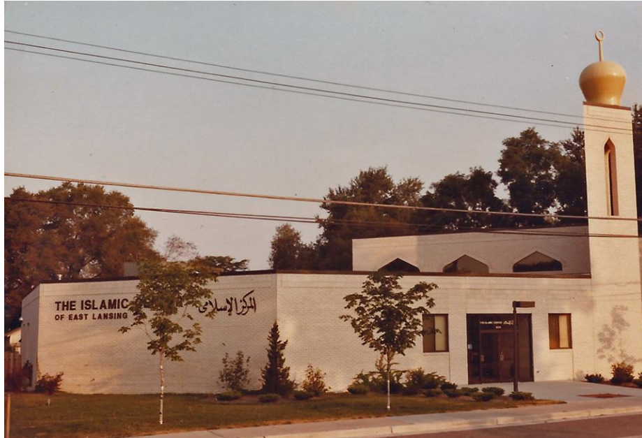
Figure 3. Photograph: The main building of the Islamic Center of East Lansing has been the same since its opening in 1979. Facebook, ICEL, August 21, 2014.