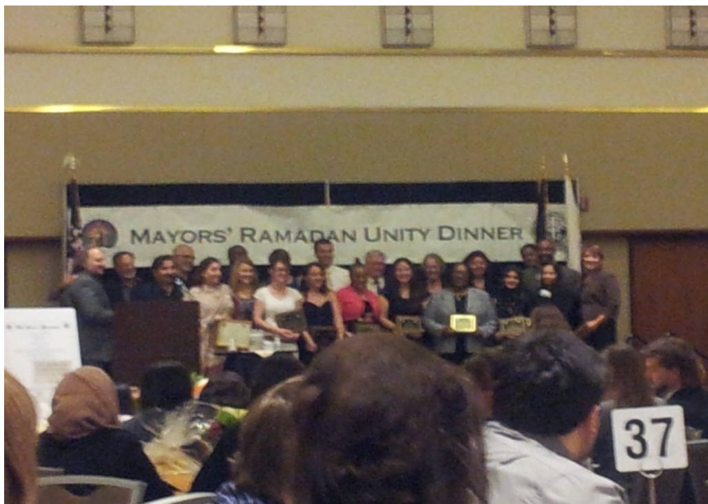
Figure 1. Photograph: Lansing and East Lansing Mayors' Ramadan Unity Dinner of 2015.

Center's property to express a negative opinion of Islam or Muslims in the global political scene. 25 However, most public relations were positive toward the mosque community. Over these years, the incidents made the Center become an even more obvious symbol of Islam in the area. For example, during this time period the Islamic Center and the cities of Lansing and East Lansing established the Ramadan Dinner. This tradition might have been inspired by a similar feast held at the White House each year, after it was initiated by First Lady Hillary Clinton in 1996. Such a courteous gathering with respect to an Islamic holy month implied that the federal government recognized and appreciated Muslims as citizens of the nation. With that in mind, the Center's other events, such as blood drives, refugee events, and student welcome parties would also strengthen the image that the Center was the ideal place in the area to see Islam and interact with Muslims.