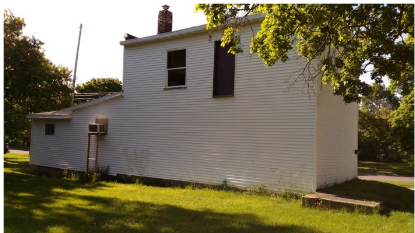
Figure 7. Photograph: Wali Mahmoud Mosque backside.