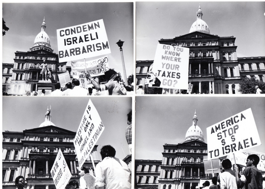
Figure 8. Photograph: Lansing Muslims demonstrate following the Israeli declaration of Jerusalem as its capital in 1980.

1996, the community purchased a house behind the mosque and used it for GLIS (Greater Lansing Islamic School) for two years. After the erection of a two-story building especially assigned for GLIS, this home was now dedicated to house the imam and his family. So, the congregation was aware of the events in the Middle East, but the impact was too slight to be felt by the community of the East Lansing mosque. That is, those events did not impact the peaceful time at the East Lansing mosque, as of its members from that time did not remember anything special, except for continuing construction to accommodate an expanding community.