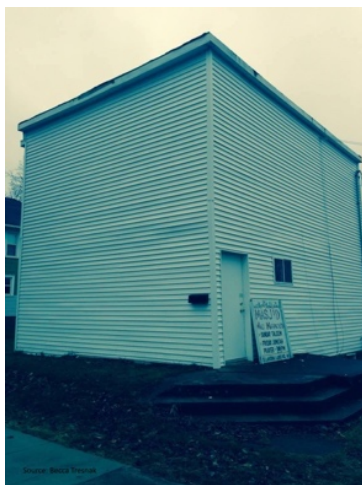
Figure 6. Photograph: Wali Mahmoud Mosque frontside.

The development of the Islamic center in East Lansing took place concurrently with the dynamics happening among the community of Nation of Islam in the area. The big difference between them was in the makeup of their pioneers. Whereas the initiation of the Islamic Center of East Lansing was pioneered by MSU students, this particular mosque was truly a grassroots movement that resulted from the great transformation within the NOI in 1975.