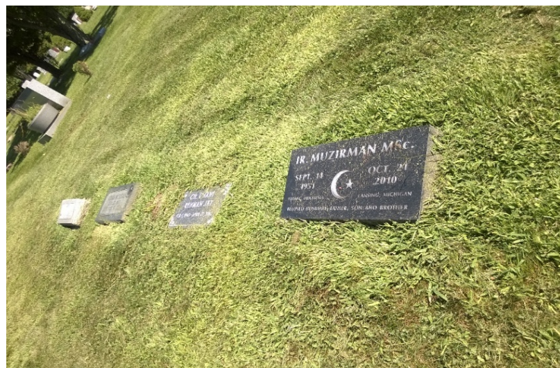
Figure 11. Photograph: A cemetery plot for a Muslim.

Another outcome resulting from mosque life was the provision of cemetery plots for burial of Muslims. Beside of the building complex of the Islamic Center, the Muslims of Lansing also owned over one hundred burial plots in a cemetery at Mt. Hope Road, two miles southwest from the Center. The community began purchasing the plots around the same time the mosque construction occurred. For each plot used to bury a body, the Center could receive a two hundred dollars from the family of the deceased. However, the fee would mostly be waived if there was a