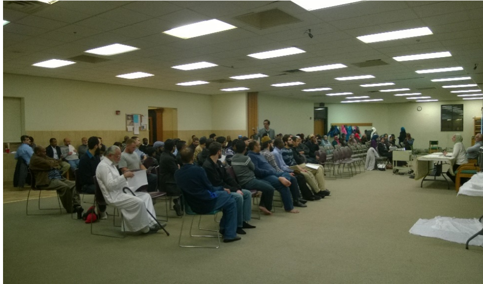
Figure 15. Photograph: Annual assembly held the evening of November 20, 2015.

Following the approval of the new constitution by the annual assembly in 2006, the number of Executive Committee members increased to 12 positions. The information committee and the student committee were dissolved, but there were four committees added, which included Community Service, Property Management, Public Relations and Outreach, and the Youth Committee. In a new development, the MSA representatives began attending the meeting of the executive committee, although structurally the student committee was no longer in existence.