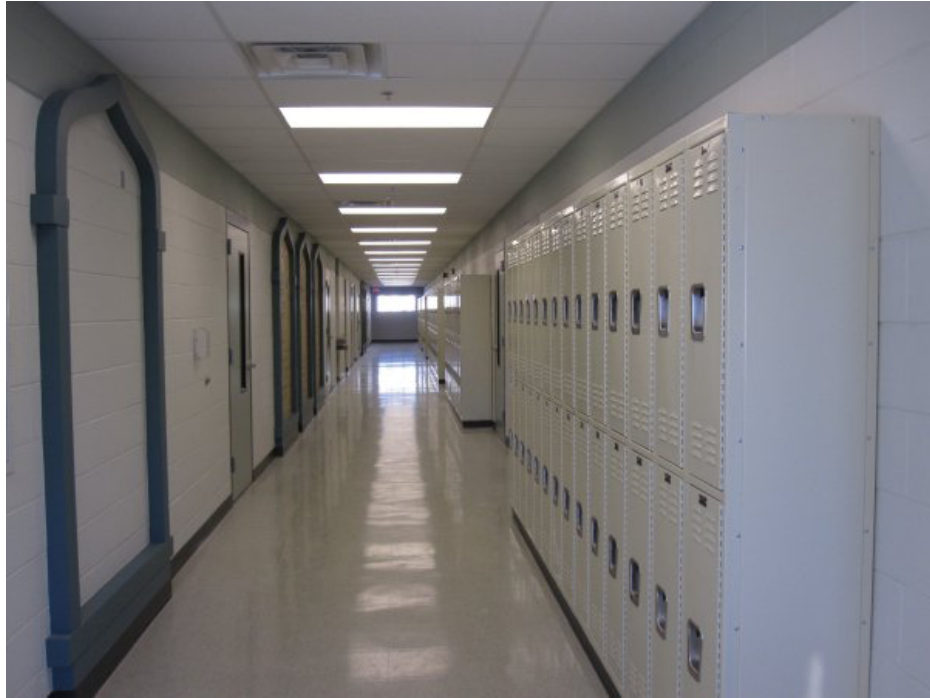
Figure 13. Photograph: Greater Lansing Islamic School, second floor, February 18, 2017.