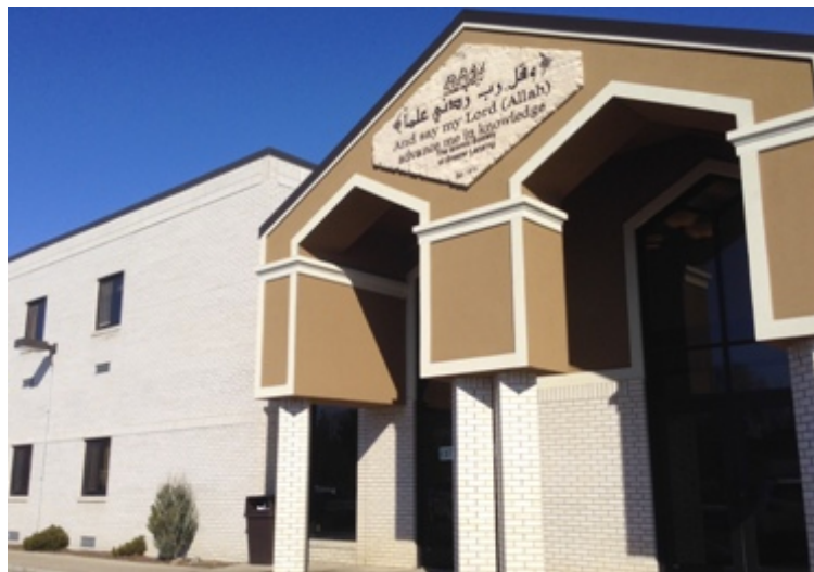
Figure 12. Photograph: Greater Lansing Islamic School (GLIS) frontgate, February 18, 2017.