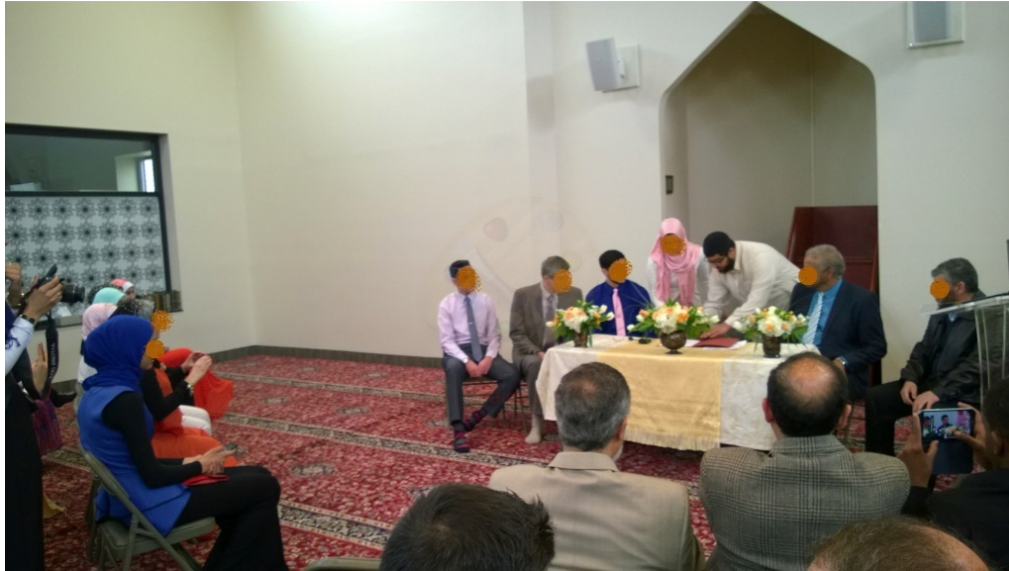
Figure 10. Photograph: A marriage ceremony held inside the prayer hall in April 2014.