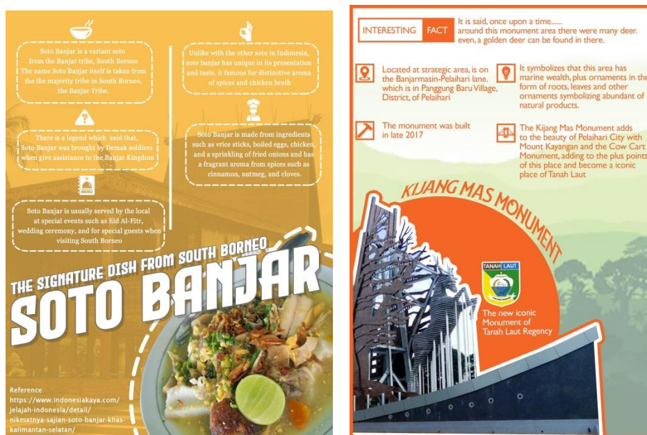
Image 4.3 Infographic made by participant

asked their understanding of the context/theme from the topic of their created infographic, and the technical issue during designing.