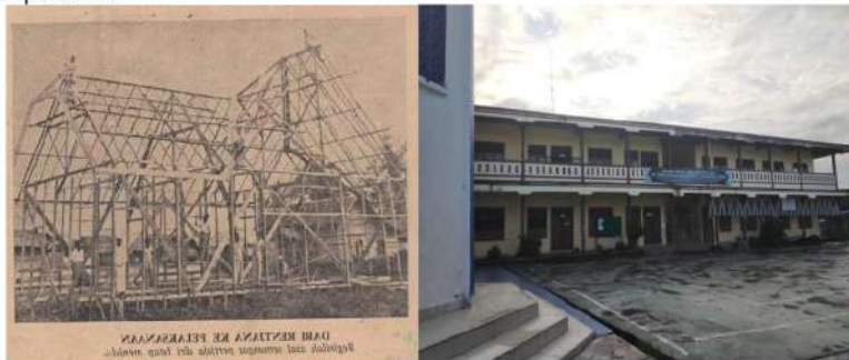
Figure 2 The renovated building in early 1952 and renovated building in 2017. Documentation 2018