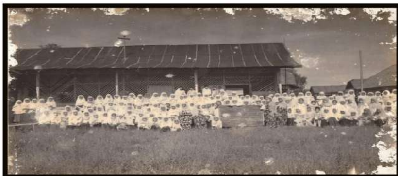
Figure 3 Female students (santriwati) with the background of a building built in 1936)

The tradition of religious education before Indonesia's independence in the trajectory of Islamic Education History, gave a little or even very rare opportunities for women to access educational institutions that provide opportunities for women to pursue education, especially attending school / madrasas in Islamic educational institutions. Especially if it combines male students ( santriwan ) and female students ( santriwati ) in one institution.