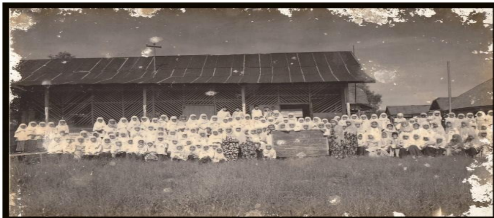
Figure 3 Female students ( santriwati ) with the background of a building built in 1936)

The tradition of religious education before Indonesia's independence in the trajectory of Islamic Education History, gave a little or even very rare opportunities for women to access educational institutions that provide opportunities for women to pursue education, especially attending school / madrasas in Islamic educational institutions. Especially if it combines male students ( santriwan ) and female students ( santriwati ) in one institution.