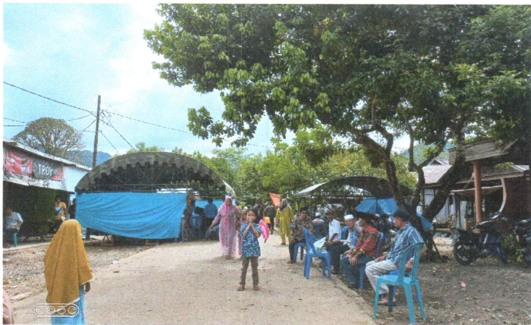
Figure 10: View of an interfaith wedding reception in Pangelak Village. Muslim men and Christian women