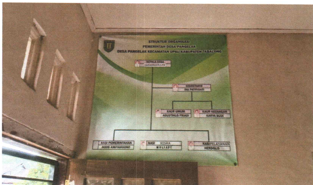
Figure 2: The government structure of Pangelak Village, Kec. Upau Kab. Tabalong