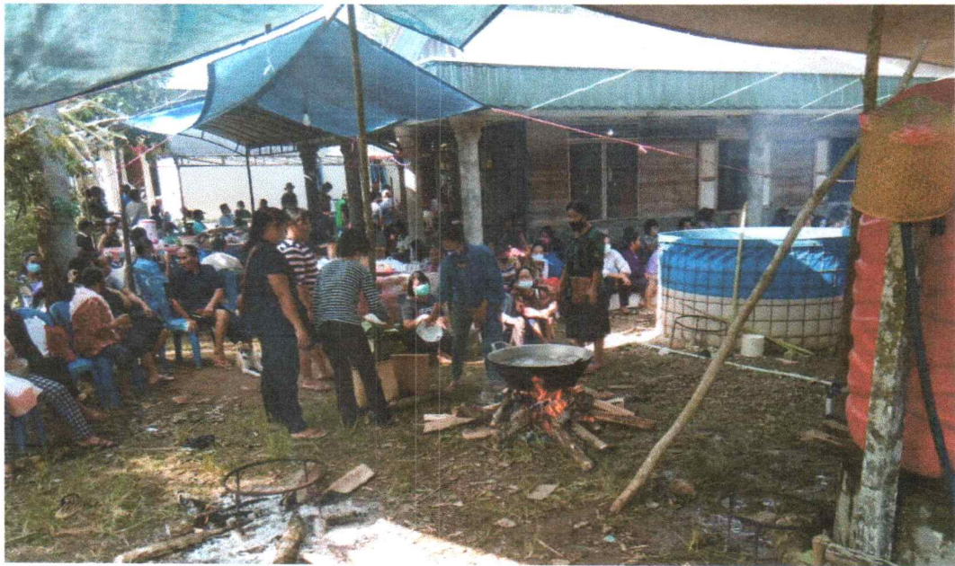
Figure 5: Gotong royong of the whole community in the funeral procession of a Christian who died