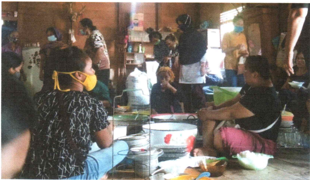
Figure 6: Gotong royong in the funeral procession for dead Christians