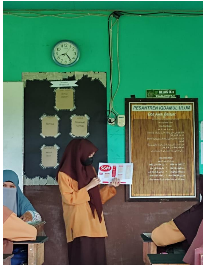
Figure 4.3. Student Present Their Label