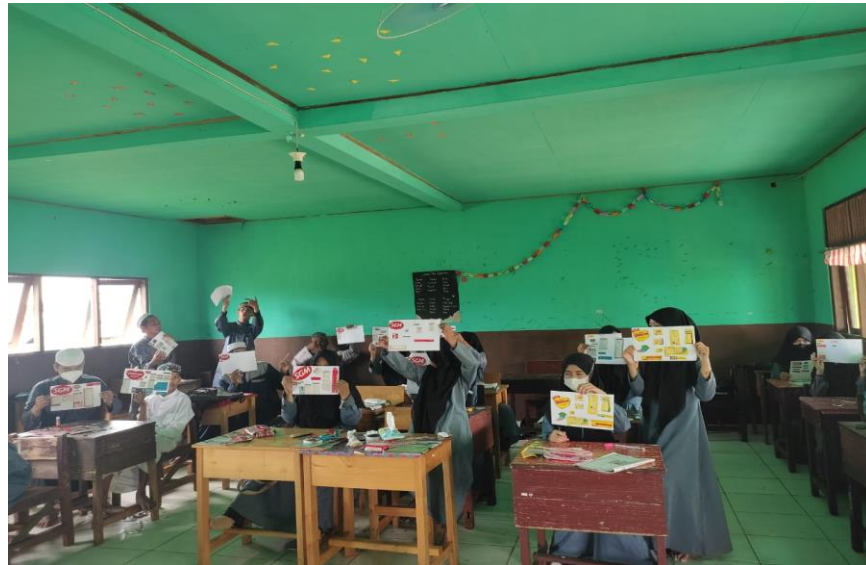
Figure 4.5. Final Assignment Of Create Label

In figure 4.5, After the students finish making labels with their own ideas, the teacher then chooses the right five labels and also finished the fastest