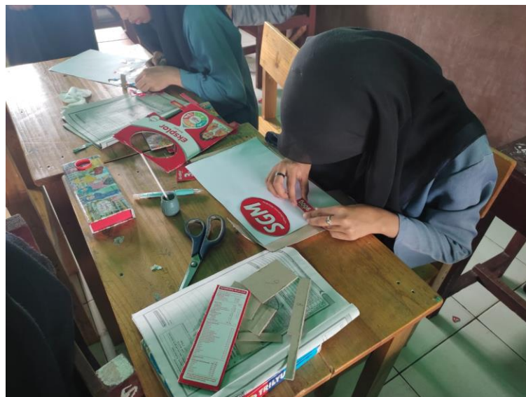
Figure 4.4. Student Create The Label

The teacher asks the students to answer the exercises individually. Students are asked to create labels like the teacher's example, as explained in the following picture.