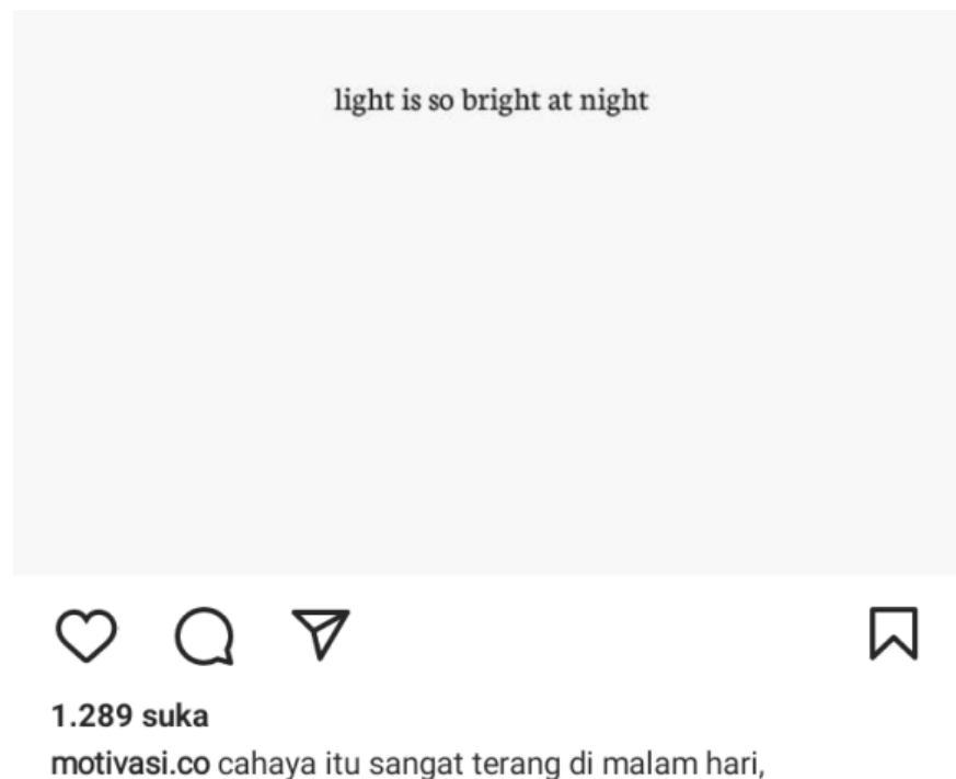
Figure 4.9 Data 9

Source language: Light is so bright at night.