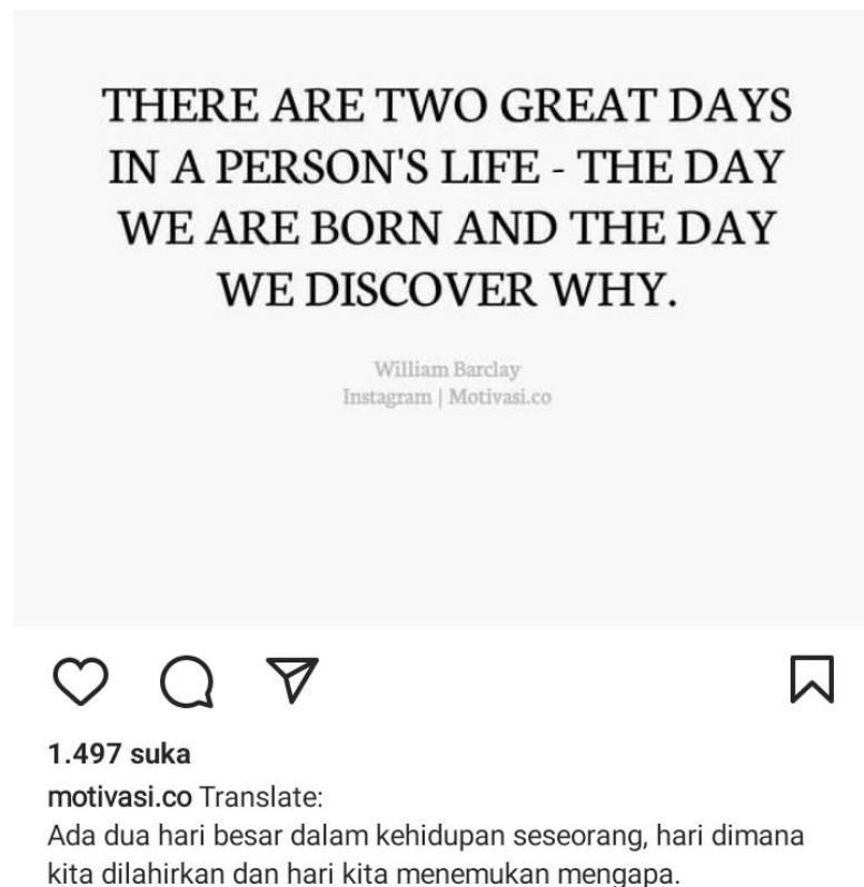
Figure 4.4 Data 4

The source language uses the plural noun "hands", which was translated into the singular noun " tangan " in the target language. Although the target language should also be in the plural form, but it cannot be translated as " tangan-tangan ". The word " dua " has already indicated that it is plural, so it should remain in the singular form. In target language, plural indicating words cannot be followed by plural words. Therefore, the change from plural to singular is classified as an intra-system shift.