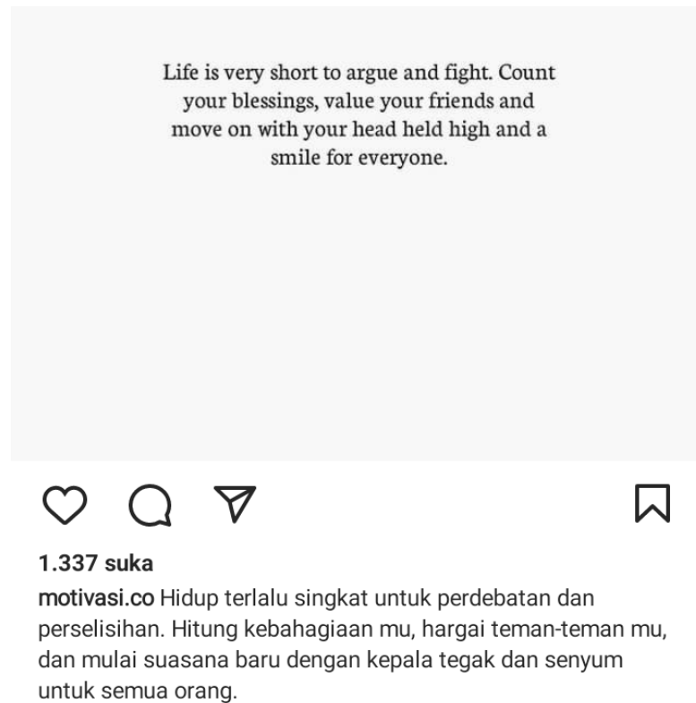
Figure 4.11 Data 11

Source language: Life is very short to argue and fight.