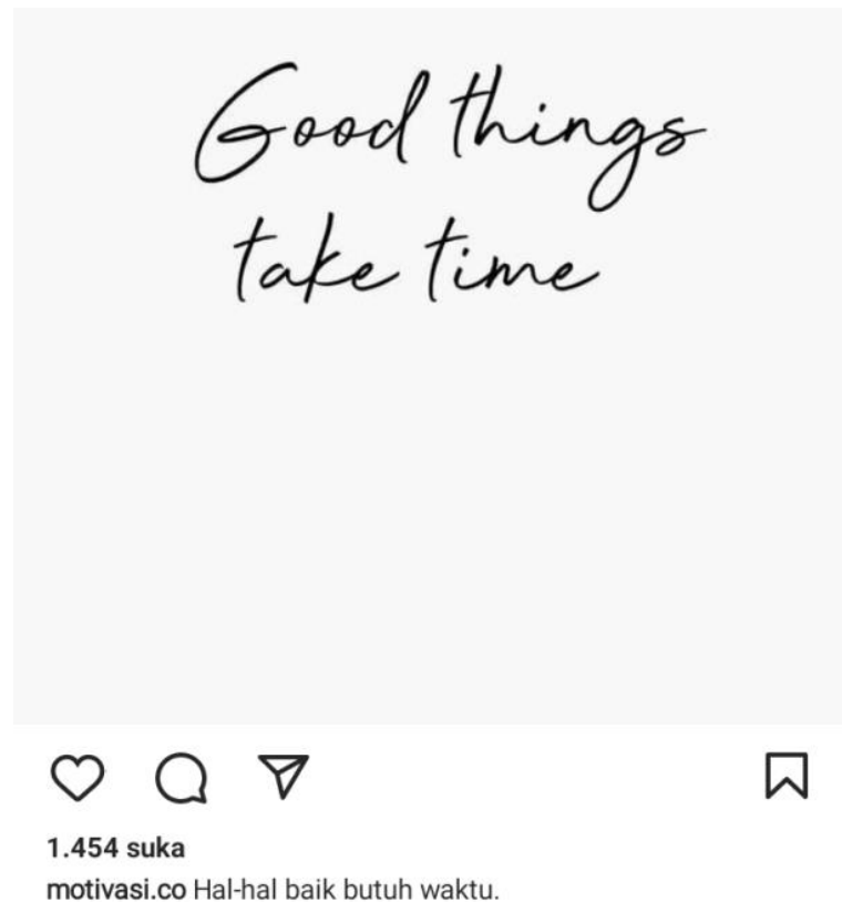
Figure 4.12 Data 12