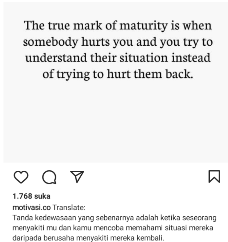
Figure 4.6 Data 6

The plural marker is redundant as the word " seribu " (thousand) indicates that the following noun is more than one.