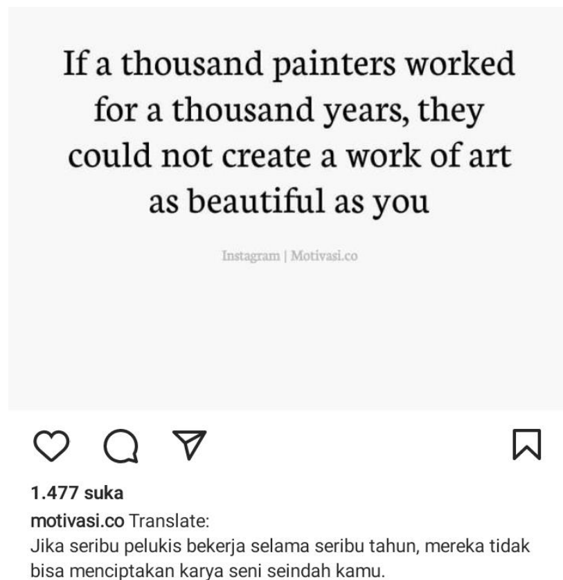
Figure 4.5 Data 5

became modifier + head, where " seseorang " is described by " kehidupan ". Hence, it can be inferred that a structure shift took place during the translation process into the target language.