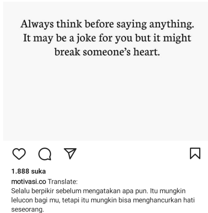
Figure 4.7 Data 7

indicates that there has been a structural shift during the translation process into the target language.