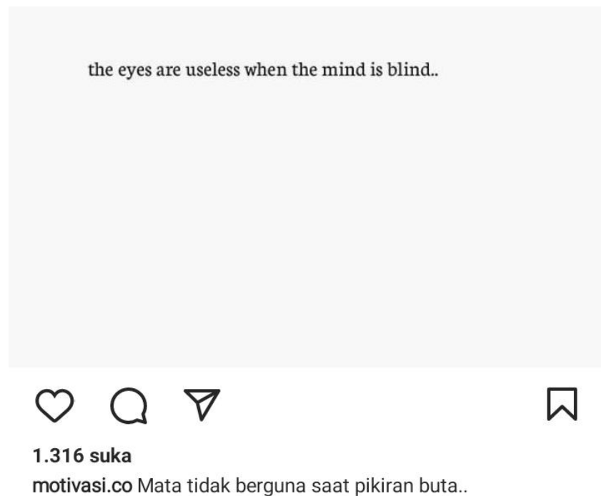
Figure 4.10 Data 10

Source language: The eyes are useless when the mind is blind.