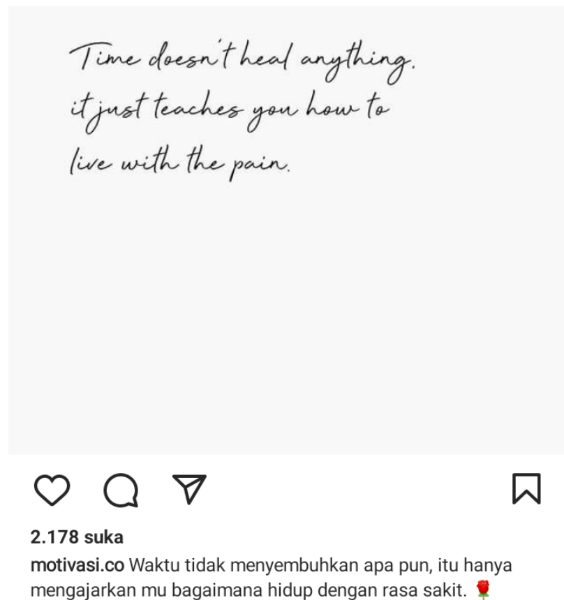
Figure 4.14 Data 14

Source language: Time doesn't heal anything. It just teaches you how to live with the pain.