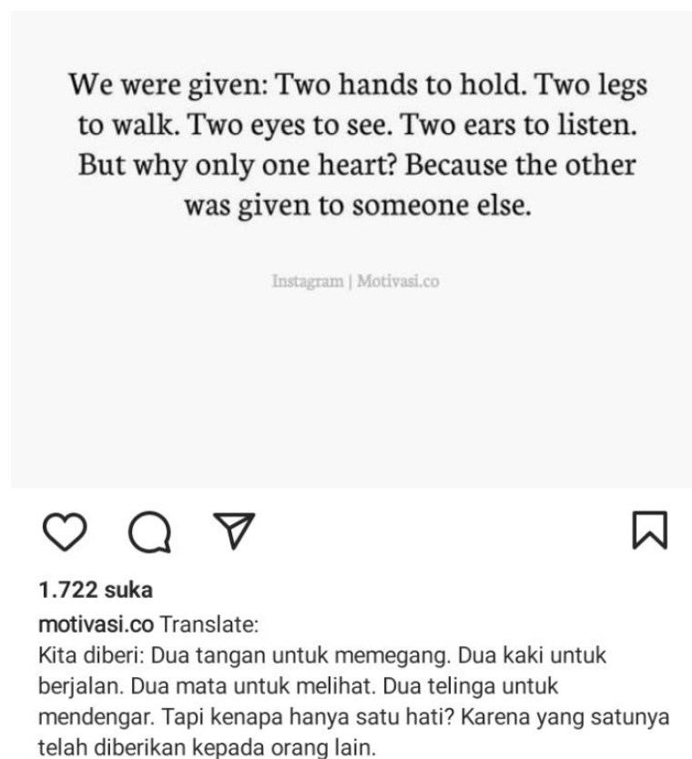
Figure 4.3 Data 3

The target language noun " hal " was used as a translation for the source language plural noun "things" in this instance. In the source language, plural nouns are formed by adding "-s" to the singular noun when there are more than one. However, in the target language, plural nouns are often formed by repeating the word, but in the case of " hal ", it cannot be translated as " hal-hal " because the word " hal " is followed by the word " dua " which indicates a plural noun. Therefore, this data is classified as an intra-system shift.