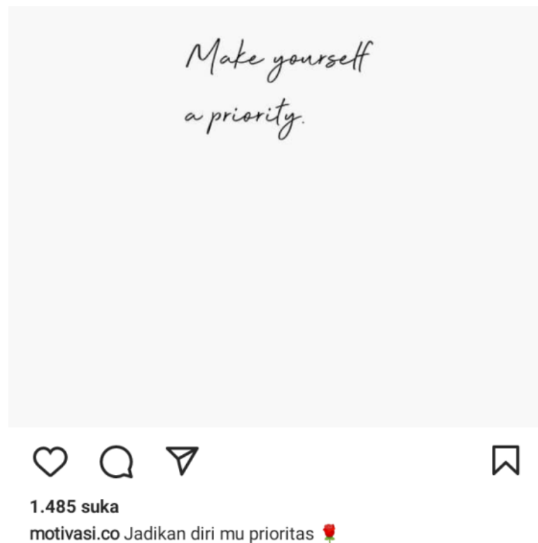
Figure 4.13 Data 13

Source language: Make yourself a priority