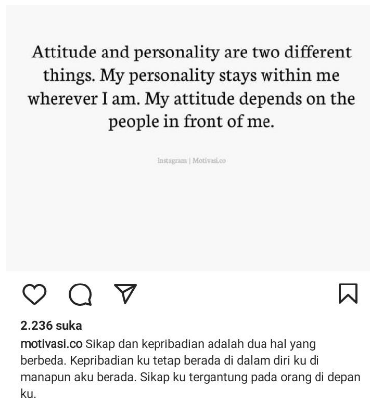
Figure 4.2 Data 2

The data analyzed by the researcher pertains to the category of intra-system shift, where a shift occurred within the target language. The plural word "hours" in the source language was translated into the singular word "jam" in the target language, as there is no plural form for "jam" in the target language. Instead, it used the singular form for one, two, or three, resulting in the shift from plural to singular.