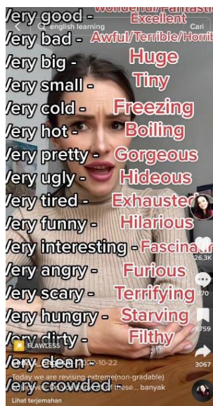
Figure 4.2. Lena's_English - Vocabulary Content on TikTok

The example of TikTok content for learning vocabulary show in picture 1.