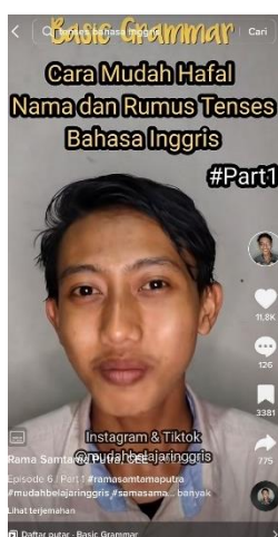
Figure 4.1. Mudah belajar bahasa Inggris – Grammar Content on TikTok.

The example of TikTok content for learning vocabulary show in picture 1