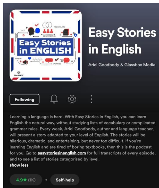
Figure 3.1 Easy Stories in English Channel on Spotify

The first channel was Easy Stories in English. In this channel the content creator focusses on providing audio storytelling. It's one of the most popular storytelling channels on Spotify, it can be seen from the rating, it rated 4,9 out of 5 by 1000+ users on Spotify. It has 172 different stories which categorized into 3 level based on the difficulties; beginner level, intermediate level and advance level. This channel still active and constantly adding audio every two week.