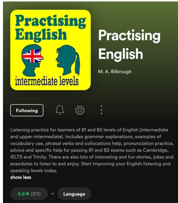
Figure 3.3 Practising English Channel on Spotify

intermediate level and advance level. The channel still active uploading audio every week. This channel has rated about 4.8 out of 5 by 211 users on Spotify.