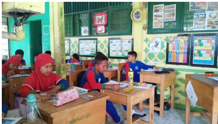
Figure 4.3. The Word Square game Implementation

For example, for the armchair was purple and the regular chair was brown. From this the students can distinguish that a chair and an armchair are two different objects. By combining Word Square games and colorful picture media, it can help students to remember the vocabulary being taught more easily.