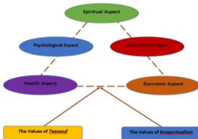
Figure 1. The Integration of Elderly Development Aspects

These five components of the elderly's development were established in an Islamic education model based on tasawuf-ecospiritualism , referred to as the “ pancalogi of integrative elderly Islamic education” in this research. The pancalogi of integrative elderly Islamic education includes five (5) aspects developed in the value-based integrative education model of tasawuf and ecospiritualism values. The following chart provides an illustration of how the integration of these five factors occurs within the paradigm of integrative Islamic education for the elderly that is based on tasawuf-ecospiritualism ;