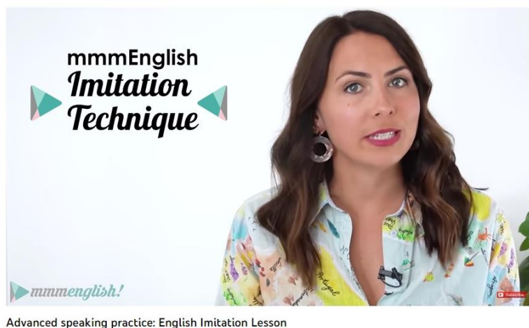
Figure 4.1 Imitation Technique by mmmEnglish channel