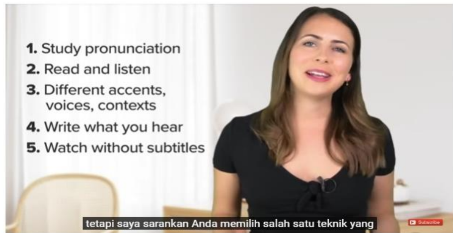
5 Tips for Better English Listening Skills

Figure 4.2 5 Tips Better English Listening Skills by mmmEnglish channel