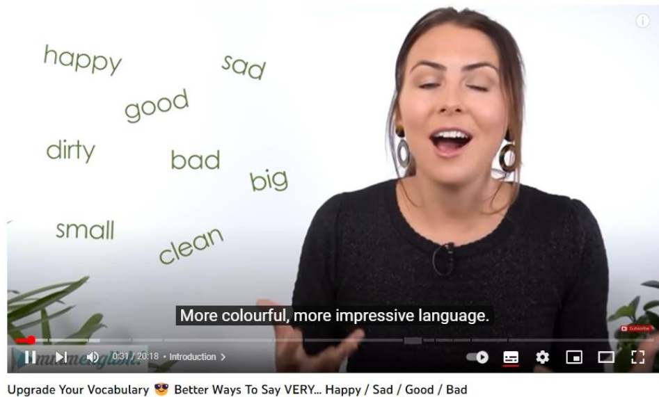
Figure 4.4 Upgrade Your Vocabulary by mmmEnglish channel

In the learning video, Emma's showed the viewer how to stop using VERY and improve your English vocabulary. By avoiding the one little word as much as we can, the viewer will be forced to be more creative and enable other English words that are more interesting, intelligent and impressive. The video has been watched by more than 1.2 million people and more than 2 thousand subscribers' commented. Use better adjectives : Use lots of adjectives, don't just use boring words, avoid just one small word, including (Emma, 2020b) :