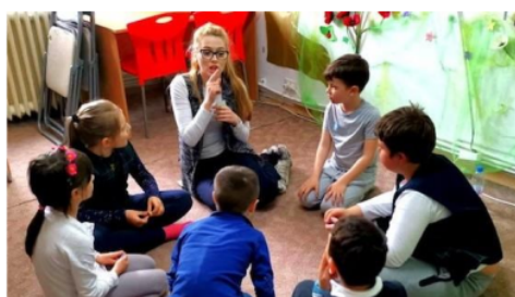
Picture 6 Using Songs

Source: https://bridge.edu/tfl/blog/esl-songs-kids-teens/