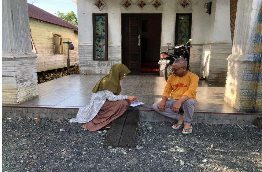
Gambar 1 Interview with the owner of ALBABA bookstore