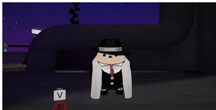
Picture 4.1.1. Role Play

Using 3D avatar for example mafia bird or other object those avatars used when interacting with players and on event like character showcase show where the player might show their avatar with extra feature of animation which pretty attractive.