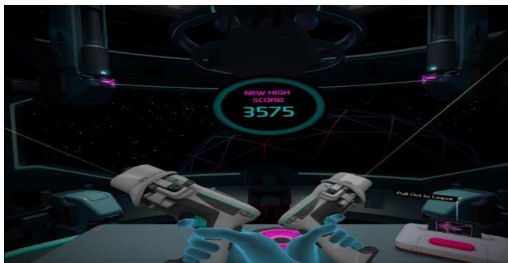
Picture 4.4.1. Simulation

The user allowed to interact with cyber object on the surrounding virtual environment when contacting the sensation will be delivered to controller. Also, if learners or students have full body track the stimulation it will be delivered into whole body.