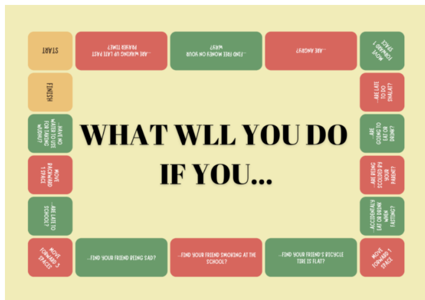
Figure 3.5. What Will You Do If You...