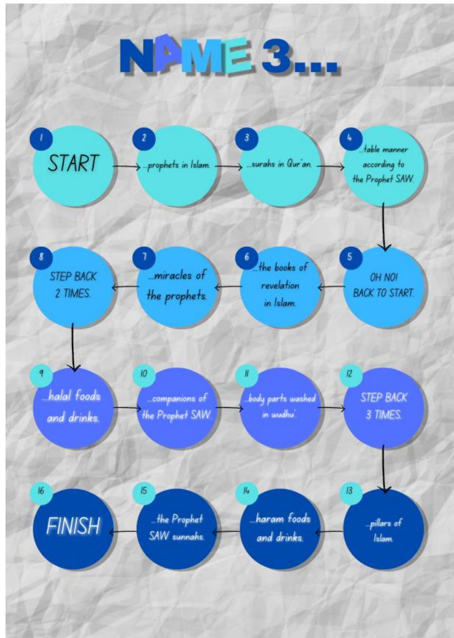
Figure 3.1. Name 3