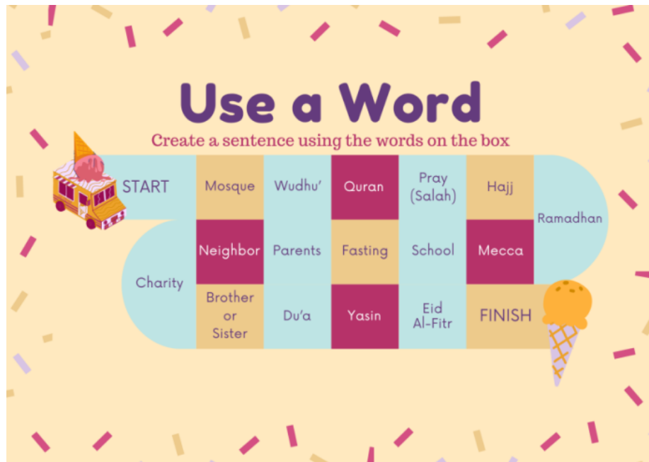
Figure 3.2. Use a Word