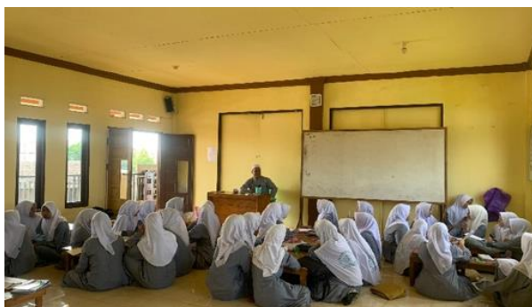
Figure 4. 6 Teacher Involvement in Students' Group Work

In addition, teachers implement a series of teaching steps that involve students in the learning process by giving individual tasks or organizing students into working groups, aiming to help students understand the material contextually and guiding them directly in the process. The active involvement of teachers shows a collaborative approach that supports the development of students' competencies as a whole. This is in line with the findings of Ervilia and Fauzi, (2024) that learning with a collaborative approach is very successful in making students enthusiastic in participating in learning.