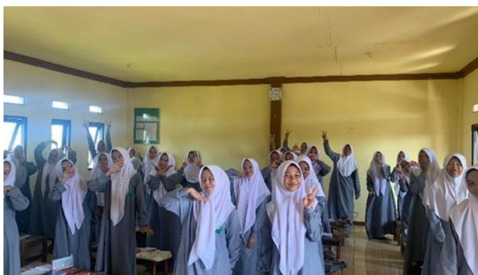
Figure 4. 5 Ice Breaking Students

A friendly and relaxed atmosphere is also applied by teachers, through positive communication such as asking how students are by saying “How are you today?” in order to build a positive emotional relationship between teachers and students, and also applying ice breaking activities as a teacher's effort to increase students' attention and interest before entering core activities. This is in line with the findings of Haryati and Puspitaningrum, (2023) regarding the impact of the application of ice breaking, which makes students become more focused on learning material and more enthusiastic in following the learning process delivered by the teacher.