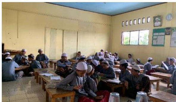
Figure 4. 4 Student Group Assignments

Based on the observation, teacher C has carried out the core learning activities well and involved students actively in their learning. Besides giving examples in every lesson, teacher C also always gives assignments to students. In the first two observations, the teacher gave individual assignments to the students, then in the last two observations, the teacher gave group assignments that supported the competency, collaborative and critical thinking approaches. This is a form of practice to strengthen students' understanding of the material that has been delivered.