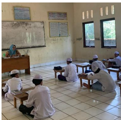
Figure 4. 3 Material Delivery Using the LKS Book

The observation results showed that teacher B had carried out the core learning activities by delivering the material using a variety of learning media. In the first and third observations in class 8 MTS A and 8 MTS B, she delivered the material using only the LKS book, while in the second and fourth observations in class 8 MTS B, she used the blackboard to explain the material. This variation in the use of media helps students in understanding the material, although its use is still limited.