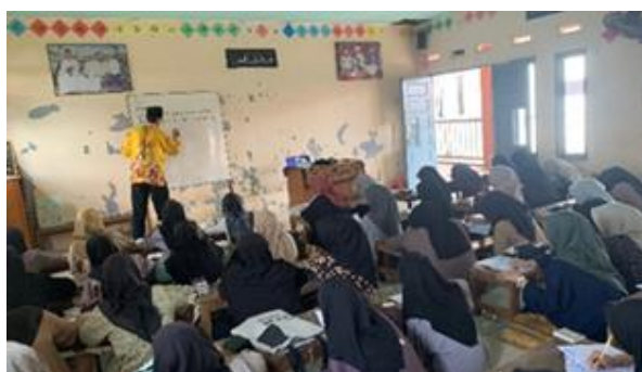
Figure 4. 2 Material Delivery Using the Blackboard

In each meeting, teacher A conveys the learning material by writing it on the blackboard, which the students follow. This method helps students to take notes and understand the key points of the material. She also provides clear explanations of the material, with relevant examples for students to easily understand.