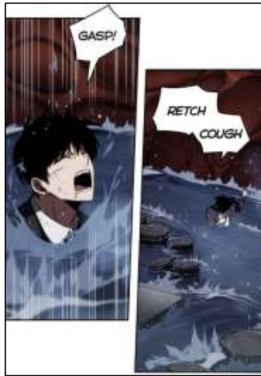
Figure 4.17 The example of onomatopoeia in episode 13