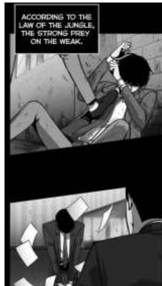
Figure 4.23 The example of allusion in episode 6

The researcher found 1 allusion used in " Omniscient Reader's Viewpoint ". The explanation can be found below: