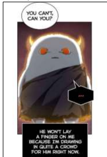
Figure 4.8 The example of metaphor in episode 13

Other than the word "constellations", "have eyes on you" is also a metaphor. "Have their eyes on you" refers to the character being the center of attention of a powerful group, that he is being watched. The author emphasizes that the character is getting their attention because of his ability.