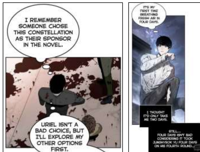
Figure 4.21 The examples of litotes in episode 8 and 15

The researcher found 2 litotes used in " Omniscient Reader's Viewpoint ". The explanation can be found below: