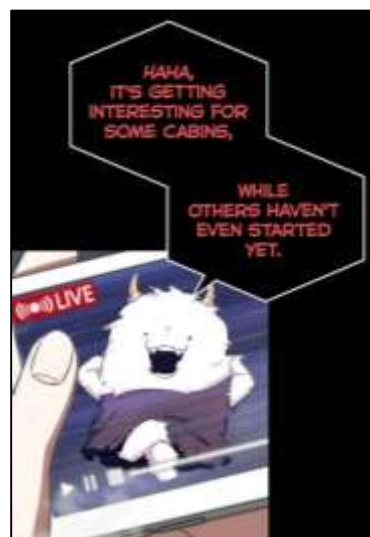
Figure 4.15 The example of onomatopoeia in episode 3

The researcher found 3 onomatopoeia. The explanation can be found below: