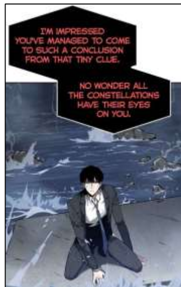
Figure 4.7 The example of metaphor in episode 13

The author used the phrase "prove my worth" to express the ability or value of someone in a relationship. The word "worth" not to be taken literally as cost, price, etc.