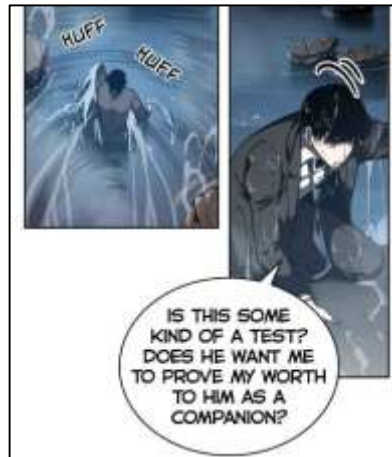
Figure 4.6 The example of metaphor in episode 13

Does he want me to prove my worth to him as a companion?