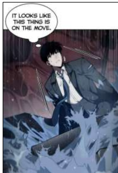
Figure 4.11 The example of simile in episode 13

The phrase "it seems like it was yesterday" is a simile since it uses "seems like" and it also contrasts the idea of how recent something seems with the literal "yesterday".