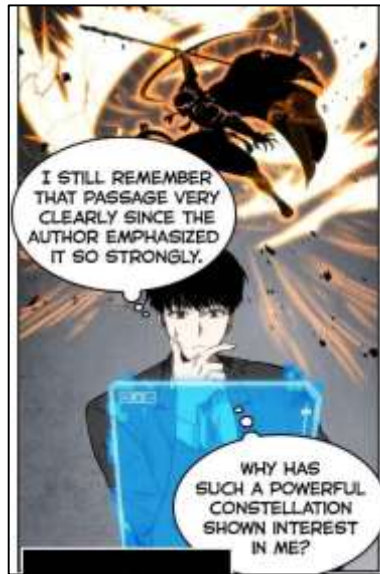
Figure 4.1 The example of metaphor in episode 8