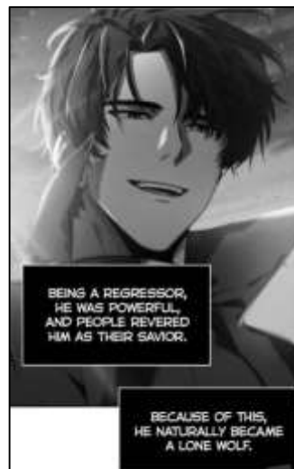
Figure 4.5 The example of metaphor in episode 13

The word "thick" is not referring to a shape of someone. Based on its full sentence, it implies to someone's brain being slow or dense therefore made his subscribers count is small. The author tried to express the character's anger or frustration through this phrase.