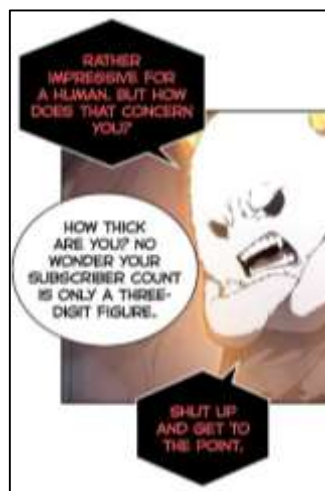
Figure 4.4 The example of metaphor in episode 14

Heart cannot literally reflects emotions such as joy. In this context, the author implied that the character experiencing happiness. Thus, it is considered as a metaphor.