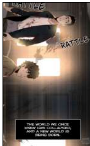
Figure 4.19 The example of personification in episode 7

Personification is to illustrate a thing that resembles a human characteristic. In this context, the cabin is not actually growing and it is not possible to grow. It indicates that the cabin is starting to get dark due to the electricity.