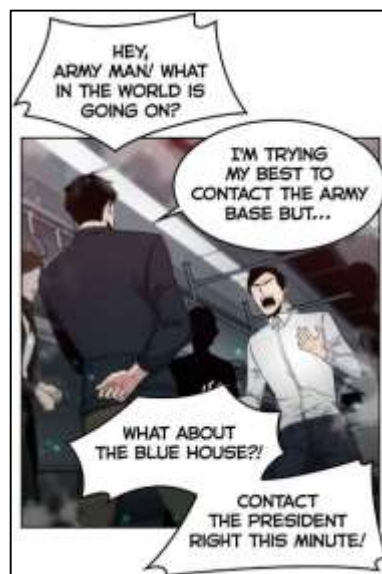
Figure 4.22 The example of metonymy in episode 3

The researcher found 1 metonymy used in " Omniscient Reader's Viewpoint ". The explanation can be found below: