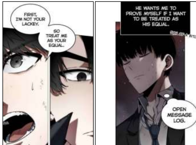
Figure 4.12 The examples of simile in episode 12 and 13