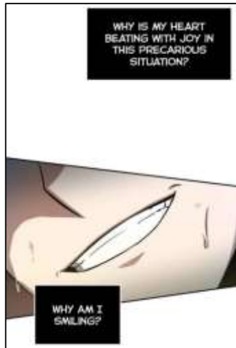
Figure 4.3 The example of metaphor in episode 5

In this context, the phrase "in a nutshell" does not imply he is inside of a nutshell itself. The word "nutshell" should not taken it literally. Thus, the phrases stated that the character is that kind of person in a summarization.