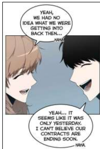
Figure 4.10 The example of simile in episode 1

The researcher found 4 similes used in " Omniscient Reader's Viewpoint ". The explanation can be found below: