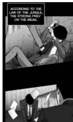
Figure 4.9 The example of metaphor in episode 6

Since the word "drawing" compares the act of bringing or gathering the crowd, it is considered as a metaphor.