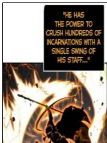
Figure 4.14 The example of hyperbole in episode 8

In this context, the author emphasizes exaggeration by saying that the character uses his phone a lot or that he is too focused on his phone as if he might get sucked in. In reality, it is not actually possible for human to get sucked into the phone.