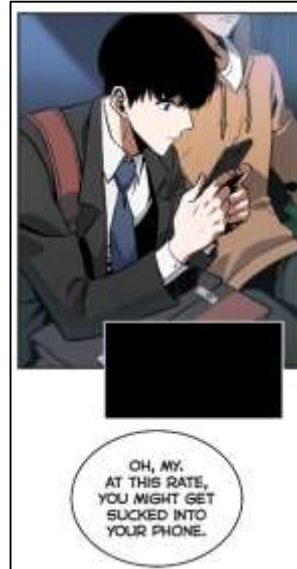
Figure 4.13 The example of hyperbole in episode 1

The researcher found 2 hyperboles used in " Omniscient Reader's Viewpoint ". The explanation can be found below: