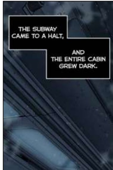
Figure 4.18 The example of personification in episode 2

The researcher found 3 personifications. The explanation can be found below: