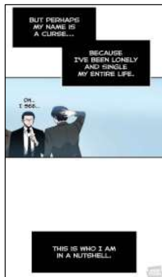
Figure 4.2 The example of metaphor in episode 5

In this case, "constellation" is not a literal stars but metaphorically the author implied to a group or an entity that has been watching the character.