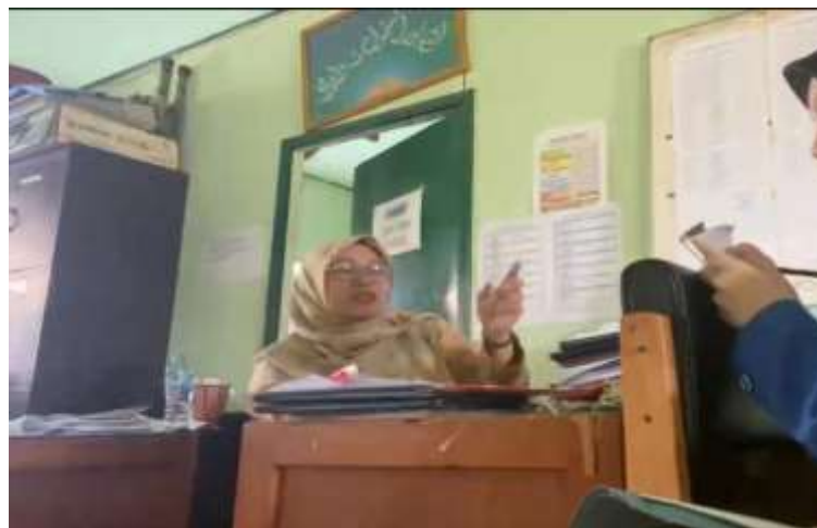
(Interview with the teacher )