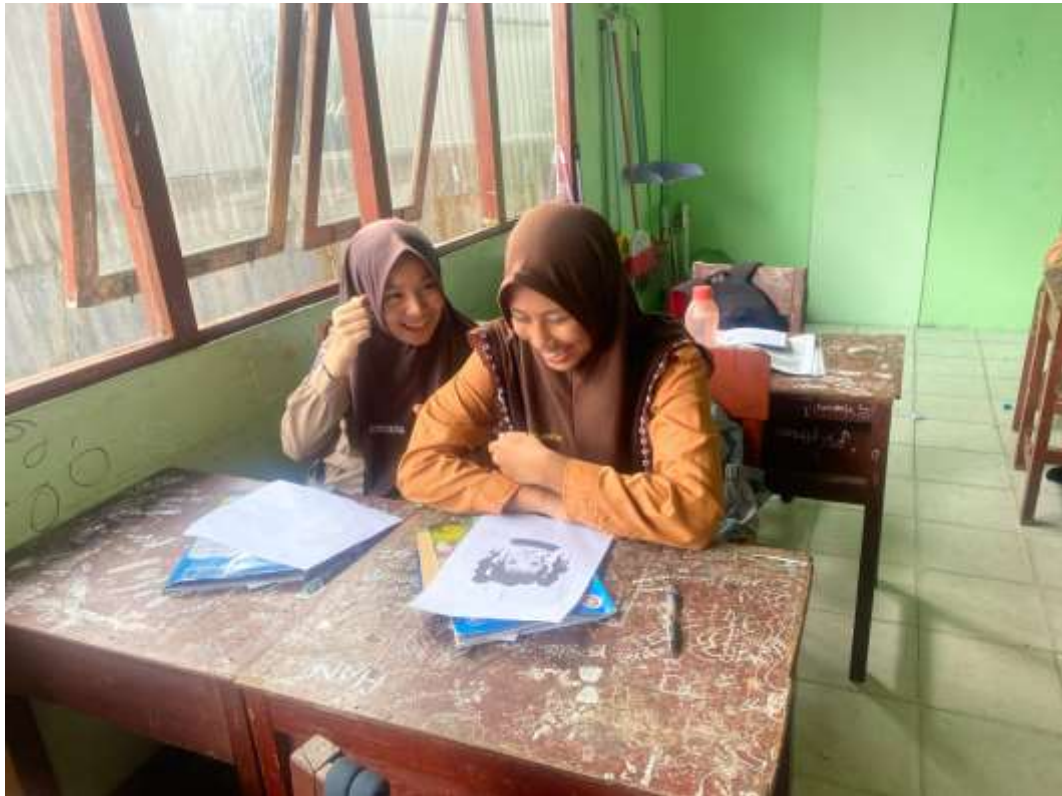
(Pair work )