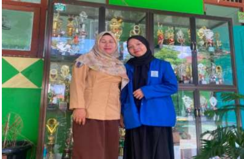
(The Researcher with the supervising teaching at MTsN 3 Kota Banjarmasin after conducting the research.)