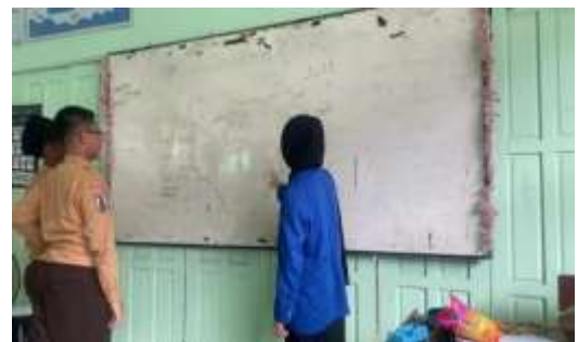
(Students are describing a character in front of the class during the Information Gap activity.)