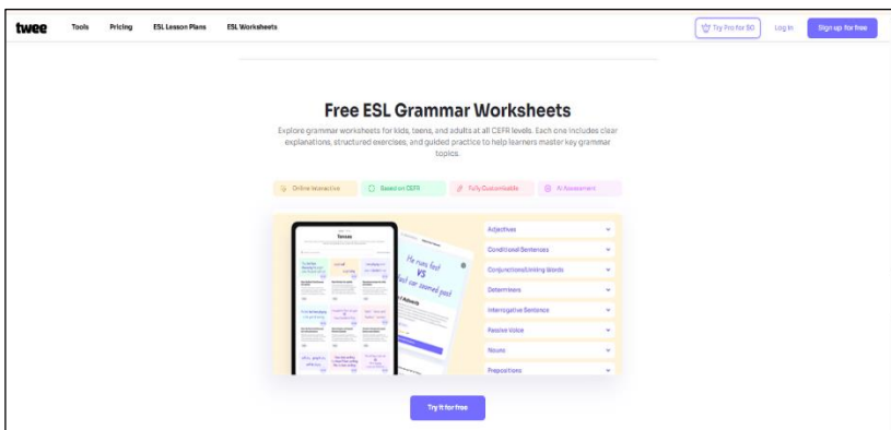
Figure 3: Free ESL Grammar Worksheets Section of TWEAI

enhancing educational productivity and supporting a range of student learning needs (Emon, 2026).