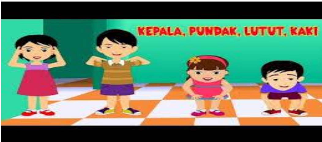
PART OF BODY