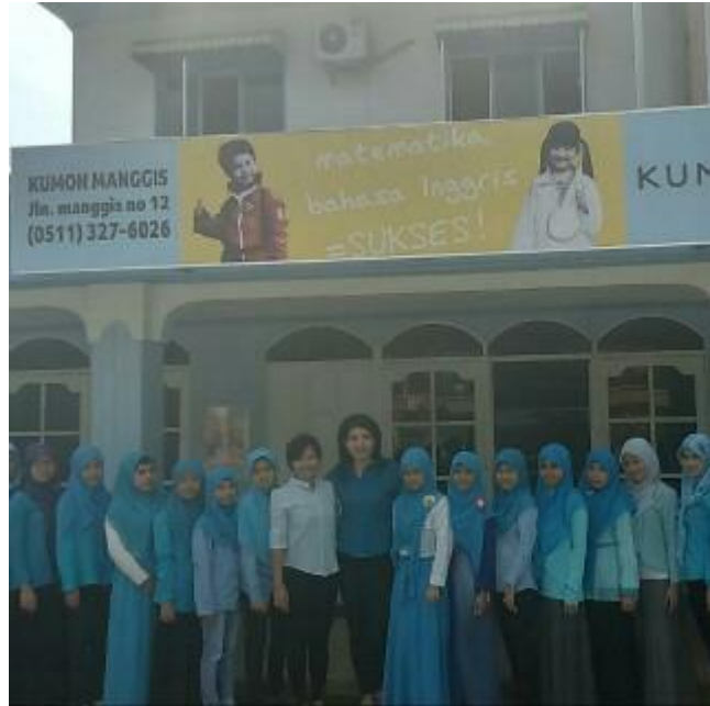
“All of the instructors of Kumon Manggis Course”