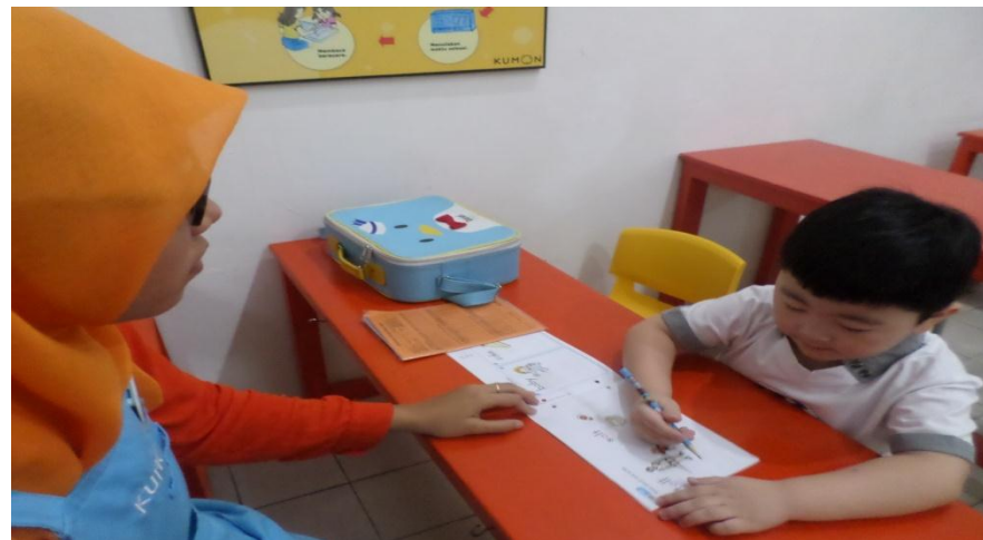
“The Instructor is guiding the student”