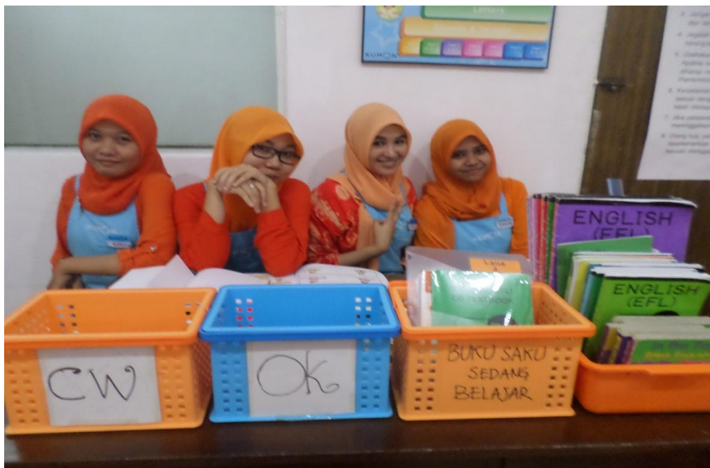
“The Instructors of EFL class”