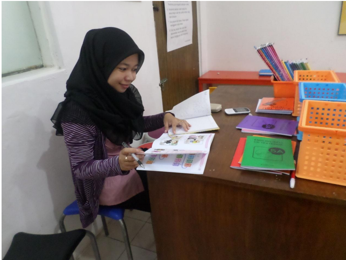
“The writer is doing the research”