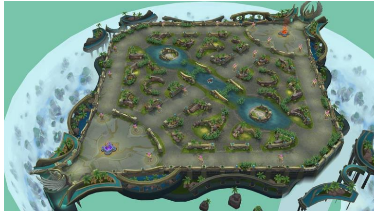
Figure 1.1 Mobile Legends Map

In each team, there are five players each control an avatar, known as a "hero", from their own device. Weaker computer-controlled characters, called "minions", spawn at team bases and follow the three lanes to the opposite team's base, fighting enemies and turrets. Every hero in Mobile Legends has unless three quotes spoken in English.