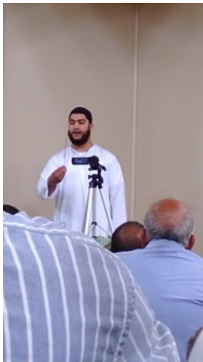
Figure 16. Photograph: Imam Mohammed Mabrouk delivering a sermon