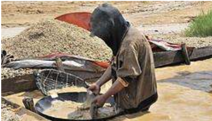
Figure 1. A person doing Melinggang or diamond panning.

The diamond panning means searching for or mining diamonds in both traditional and modern ways (Azkia: 2018, pp. 59-69). In traditional events, panning is done by separating sand, soil, and diamonds using a simple tool called Dulang or Linggangan . Because of that, the job of finding diamonds is called panning or Mendulang . Meanwhile, the person is called Pendulang .