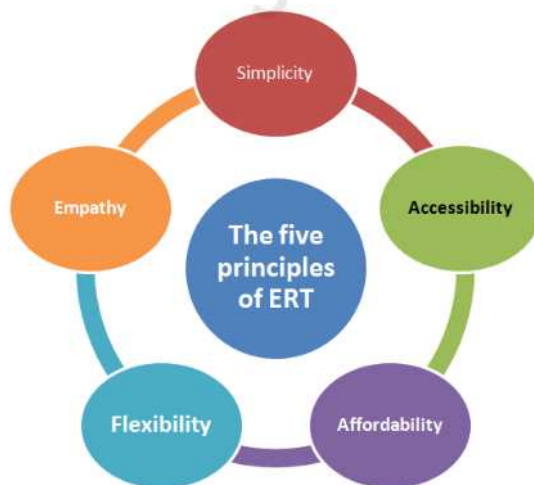
Figure 2. Five Principles of Emergency Remote Teaching