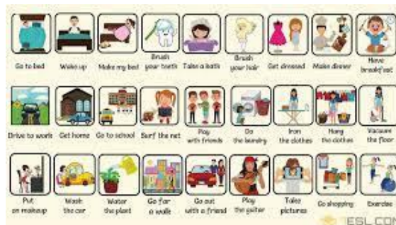
Figure 1. Establishing a routine

Establishing a routine: Refraction of something that becomes routine is something positive when applied in learning. Likewise, routines can be used for children's English activities at home (Butler & Le, 2018; Rahimi & Yadollahi, 2011). In training and learning, it is a good idea to handle short but frequent learning sessions. This method is better than long sessions but is very rare. For example, half an hour in the morning and evening is enough for learning and practice for early childhood. According to Helton et al. (2018), family success is the achievement of welfare starting from routines such as rest time, meal times, and homework. Helton and his colleagues believe that parents and young children can quickly adapt to many things in a close family environment. Then routines,