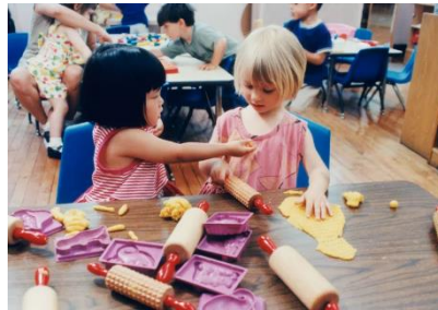
Figure 4. Engage roleplaying

Biggers et al. (2015), are very relevant and support the promotion of children learning English at home. Where according to them, parents can translate learning into real-life situations. The reason they do this, cognitive, inquiry barriers, and encouragement for the primary exemplary behavior of parents for early childhood can quickly occur. Many objects from the home environment can naturally practice language skills in context and relevant content. For example, they explain food when children eat, learn new vocabulary while playing with toys, and tell stories while tidying them up. Teach the vocabulary of banking goods when parents go shopping. Improve through repeating vocabulary when parents cook in the kitchen (Gee, 2012; Maybin, 2006).