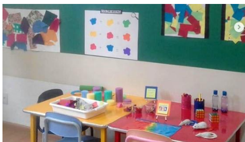
Figure 3. Real situation

It is undeniable that children will learn more naturally if they are presented with learning in a fun atmosphere ( Ashraf et al., 2014 ). Successfully investigated the impact of online games on vocabulary learning in low-intermediate English as a Foreign Language learners' class. So, presenting flashcards, for example, would be a great way to attract children's interest in learning develops vocabulary lessons. Parents can play many different learning games with flashcards, such as memory training, Kim's games, Snap and Happy Family ( Raikes et al., 2019 ; Yazejian et al., 2015 ). Creative parents will get free or online flashcards on various themes on the Kids English learning website. There are many other types of games that parents can take home for children to provide parents with more learning resources that will help them practice vocabulary and other English content. Mahmoud & Tanni (2014) , also conducted a similar study, which successfully applied fun games to promote young children's motivation towards learning vocabulary.