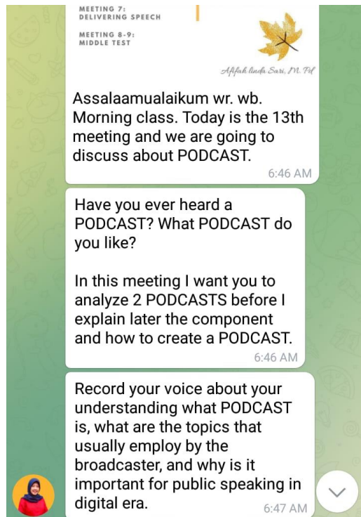
Figure.4.1: Warm up Questions

The warm up questions can be seen in the figure below.