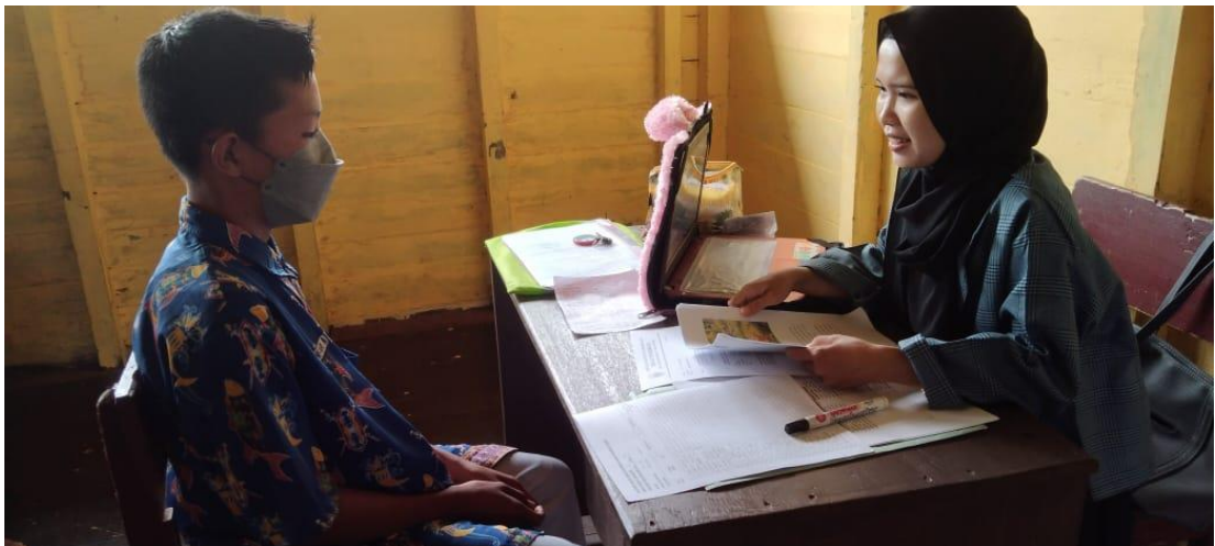
The teacher conducts interviews with the student