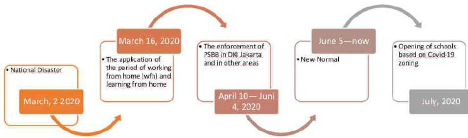
Chart 1. The Impact of Covid-19 on the World of Education in Indonesia

As in Chart 1 above, since March 16, 2020, there has been a 'lockdown' of schools, and students were required to study at home. The steps taken by the government through the minister of education and culture are implementing online/home learning. Several government steps in the education sector can be seen from the policies taken. First, the issuance of Circular number 2 and number 3 of 2020 concerning the Prevention and Handling of Covid-19 within the Ministry of Education and Culture and in the Education Unit. These two Circular Letters are about health protocols and communication channels that are implemented as an effective form of prevention from spreading and breaking the chain of this dangerous virus. Secondly, the issuance of Circular number 4 of 2020 concerning the Implementation of Education in a Covid-19 Emergency, which is strengthened by a new Circular Number 15 of 2020 concerning Guidelines for Organizing Learning from Home in the Emergency of the Spread of Covid-19. In Circular Number 4 of 2020, there are several government policies related to the National Examination cancellation, school exams, class promotion, admission of new students, assistance funds, and the learning process at home.