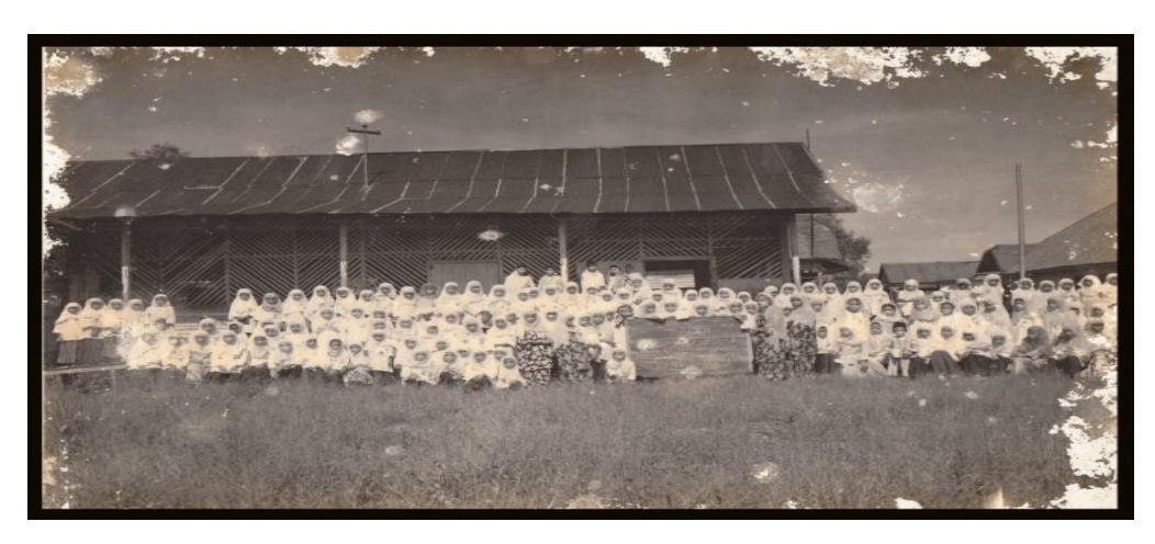
Figure 3 Female students (santriwati) with the background of a building built in 1936)

The tradition of religious education before Indonesia's independence in the trajectory of Islamic Education History, gave a little or even very rare opportunities for women to access educational institutions that provide opportunities for women to pursue education, especially attending school / madrasas in Islamic educational institutions. Especially if it combines male students (santriwan) and female students (santriwan) in one institution.