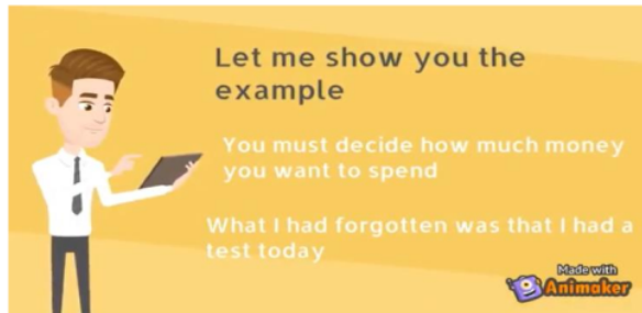
Figure 2. Examples for the grammar topic explained.