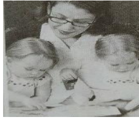
Figure 4. 1. b. 3. Caring the Child

The picture showed that the female behavior appeared to be caring the child. It called stereotype to female in behavior because the behavior aimed to female. On the other hand, female defined as a lovely person how the picture above.