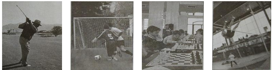
Figure 4. 1. b. 1. Male Behaviors Stereotype of Sports

The male behaviors in sports included playing golf, playing football, playing chess, and high jumping.