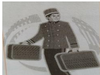
Figure 4. 1. a. 1. Porter

The data found in chapter 1 on page 16 in exercise about occupations of male and female. The following picture :