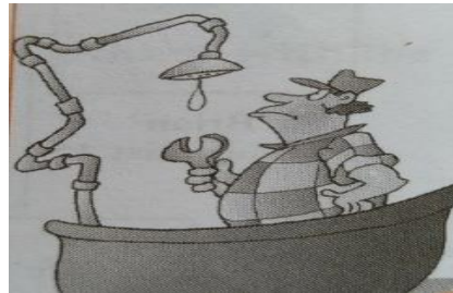
Figure 4. 1. a. 2. Repairman

Based on the data found on the same chapter and page with porter , the occupation also is stereotype to male in social role (occupation). The following picture :