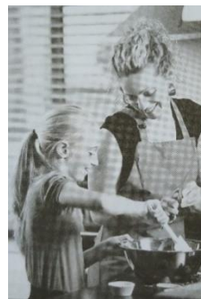
Figure 4. 1. b. 4. Cooking

According to the data found in chapter 7 page 126, there are 2 females are cooking in the exercise text with instruction to look for the differences between talking about past events or actions in English and Bahasa Indonesia. The following picture: