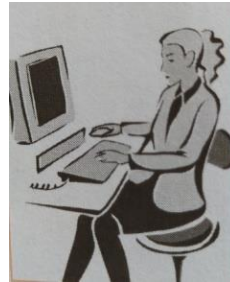
Figure 4. 1. a. 3. Secretary

and match the workplaces are suitable for the jobs. The following picture :