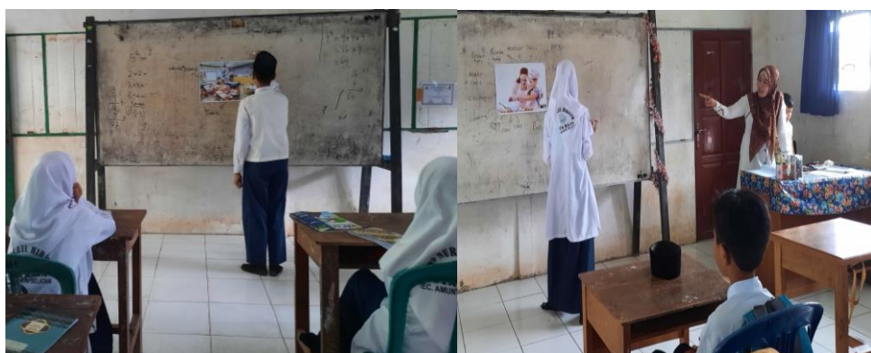
Figure 4.5 Students label the picture chart