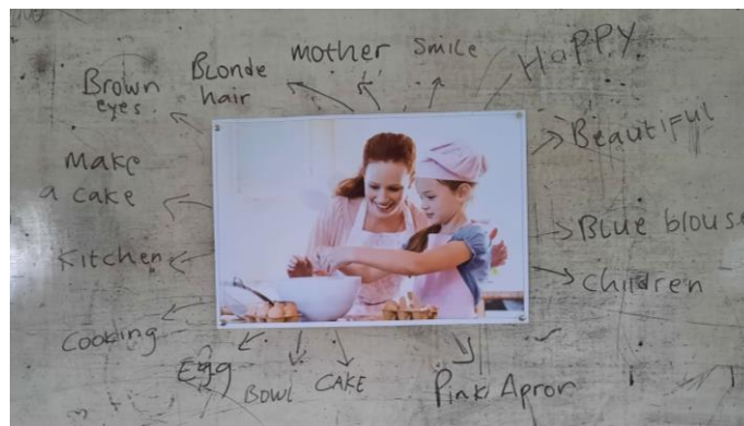
Figure 4.3 The example of Picture Word Inductive Model

In the results of observations, the researcher found the teacher asked questions and gave labels based on students' answers to the pictures, after the teacher gave an overview by giving several questions related to the pictures, the teacher asked students to continue looking for and writing nouns or physical conditions based on what they found in the pictures and write to whiteboard and into notebooks.