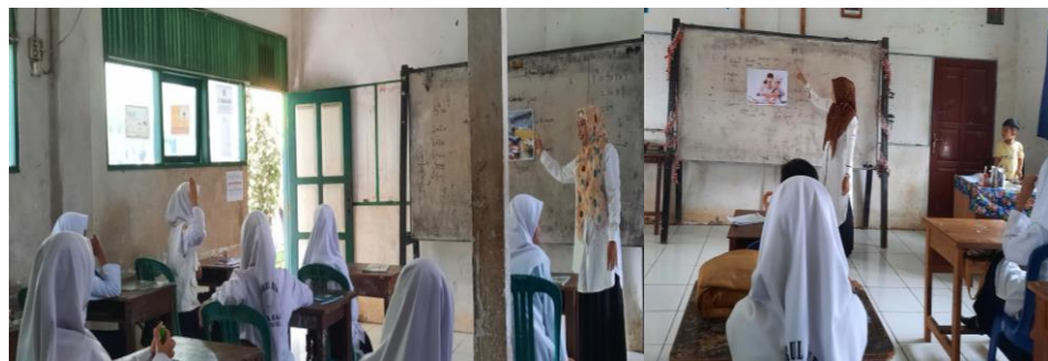
Figure 4.8 The teacher asked students to give a title to the picture