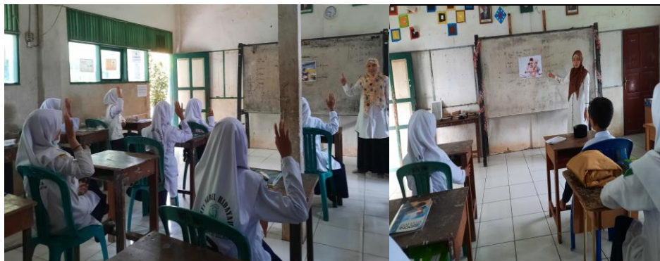
Figure 4.4 Student identify a picture

The results of these observations could be seen below :