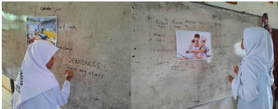
Figure 4.9 Students make a sentences ( in whiteboard and notebook)