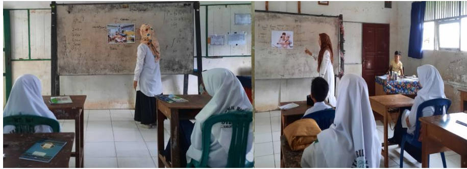
Figure 4.6 Students read the word ( add word and classified the word)