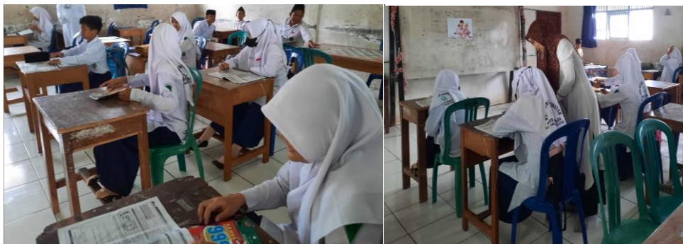
Figure 4.10 Students read and review the sentences or paragraphs