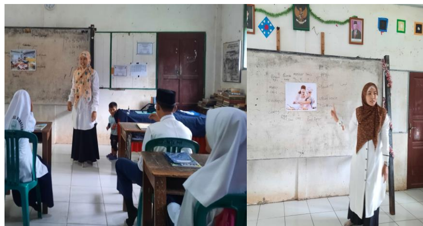
Figure 4.7 The activity of reading and reviewing the word