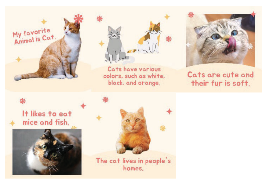
Figure 4.1 Teacher Example of Instagram Carousel

post. Before that, students were asked to fill out a worksheet about the characteristics and description of the animal in a worksheet. To help the students in their task, the teacher provided examples of other Instagram carousels about animals, so that the students could have a better understanding of what was expected of them.