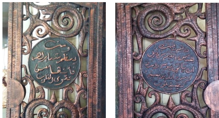
Pict. 3.10 Qur'an calligraphy in chapter al-Hajj verse 32 and chapter al-Rûm verse 43, which are found at the entrance to the right and left rear sides of the mosque

“But set thou thy face to the face to the right Religion, before there from come from God the Day which there is.” 25