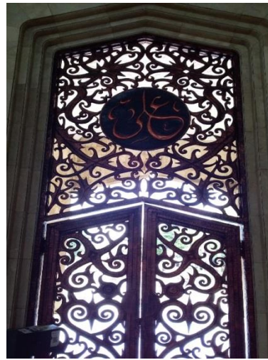
Picture 3.3 Arabesque pattern on the mosque doors (Researcher Observation Result)