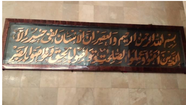
Pict. 3.7 Qur'an calligraphy chapter al-'Ashr verses 1-3 in the main room of the mosque in the back right

By (the Token of) time (Through the ages).(1) Verily Man is in loss (2) Except such as have Faith, and do righteous deeds, and (join together) in the mutual teaching of Truth, and of Patient and Constancy (3). 20