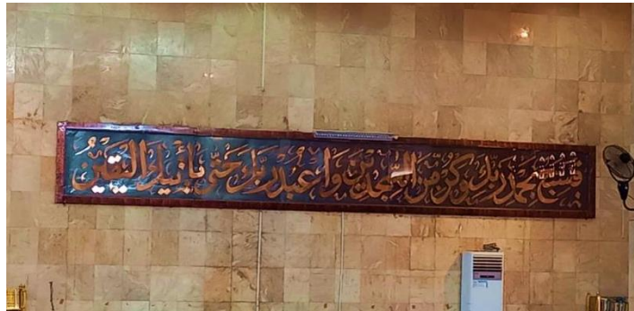
Pict. 3.5 Qur'an calligraphy chapter al-Hijr verses 98-99 in the main room of the mosque to the right of the mihrab

But celebrate the praises of the Lord, and be of those who prostrate themselves in adoration(98) And serve the Lord until there come unto the hour that is certain. 18