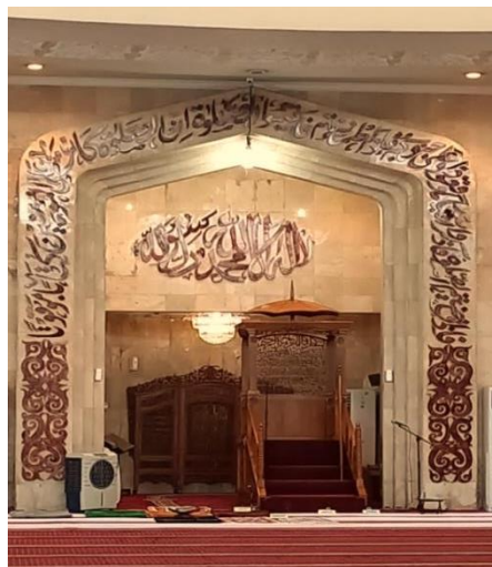
Pict. 3.4 Qur'an calligraphy chapter al-Nisâ' verse 103 on the mihrab of the Great Mosque Sabilal Muhtadin

When ye pass (Congregational) prayers, celebrate God's praises, standing, sitting down, or lying down on your sides; But when ye are free from danger, set up regular prayers are enjoined on believers at stated times. 16