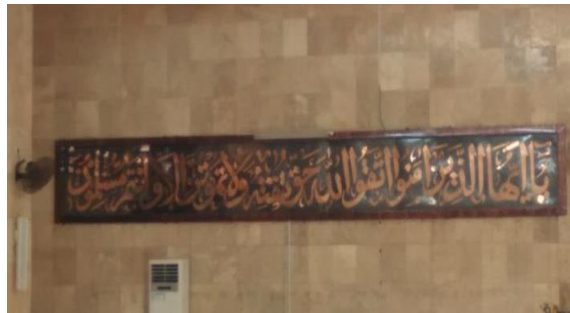
Pict. 3.6 Qur'an calligraphy chapter Ali 'Imrân verse 102 in the main room of the mosque to the left of the pulpit

“Ye who believe! Fear God as He should be feared, and die not except in a state of Islam.” 19