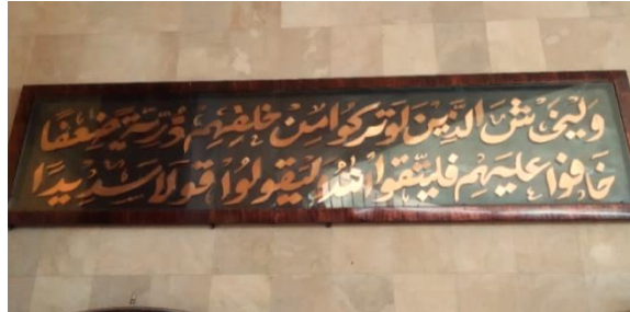
Pict. 3.8 Qur'an calligraphy chapter al-Nisâ' verse 9 in the main room of the mosque, back left

Let lose (disposing of an estate) have the same fear in their minds as they would have for their own if they had left a helpless family. Let them fear God, and speak words of appropriate (comfort). 21