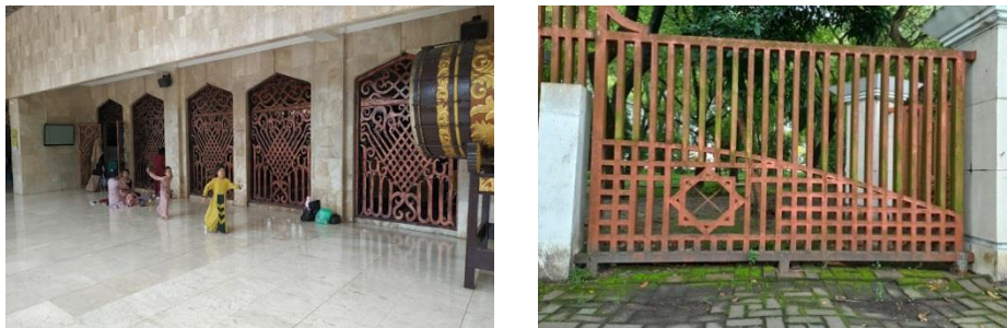
Picture 3.1 Geometric Patterns on the Windows and Fences of the Sabilal Muhtadin Great Mosque (Researcher Observation Result)

In addition to geometric patterns, arabesque patterns are also used as decoration in this mosque. The arabesque pattern is a pattern formed from interrelated spiral shapes which then merge rhythmically to form leaves or flowers. 14 This pattern is found on the ceiling of the mosque such as the inside of the dome, the ceiling inside and outside the mosque and a small part that adorns the calligraphy on the mosque's mihrab.