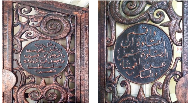
Pict. 3.9 Qur'an calligraphy surah al-Isrâ' verse 80 and verse fragments from surah al-Ankabût verse 45, which are found at the entrance to the right and left front sides of the mosque

“....And establish regular prayer: for prayer restrains from shameful and unjust deeds.....” 23