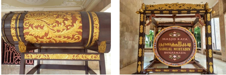
Pict. 3.11 ebb and flow patterns (left) and carvings of noni fruit and jasmine on the pillars supporting the drum (right)

congregation of the Sabilal Muhtadin Banjarmasin great mosque still feel the elements of Banjar cultural locality, even though only a small part. 28