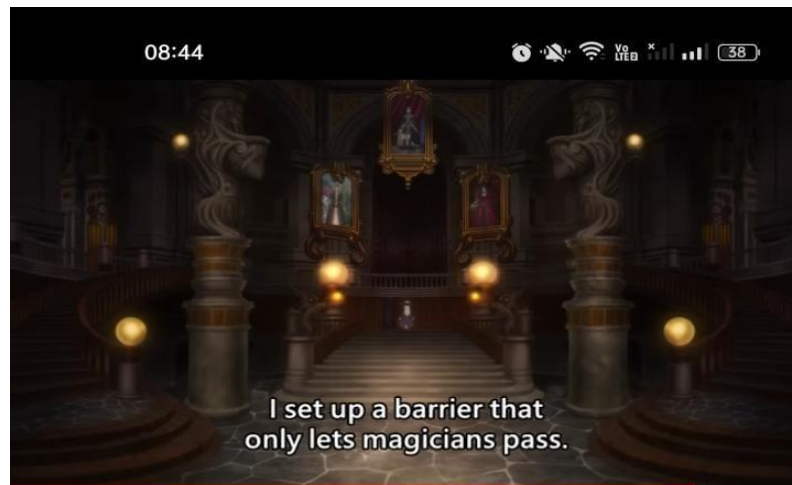
Figure 4.4. The screenshot of using connecting strategy to understand an unknown vocabulary

"In this section, I don't know much about the meaning of the vocabulary, so I connected it with the previous sub, in the previous sub it said "to be able to make the palace safe," but in this sentence I don't quite know the vocabulary like 'set up' or 'barrier' , so as far as I know, it's probably the princess cast a spell or put up a protection around the castle, and only her fellow magicians can get through" (P4, Script 4)