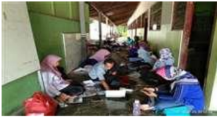
Internal training, IT Mastery in preparing Online learning