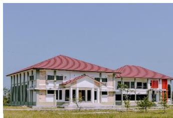
AVR and Sport Center