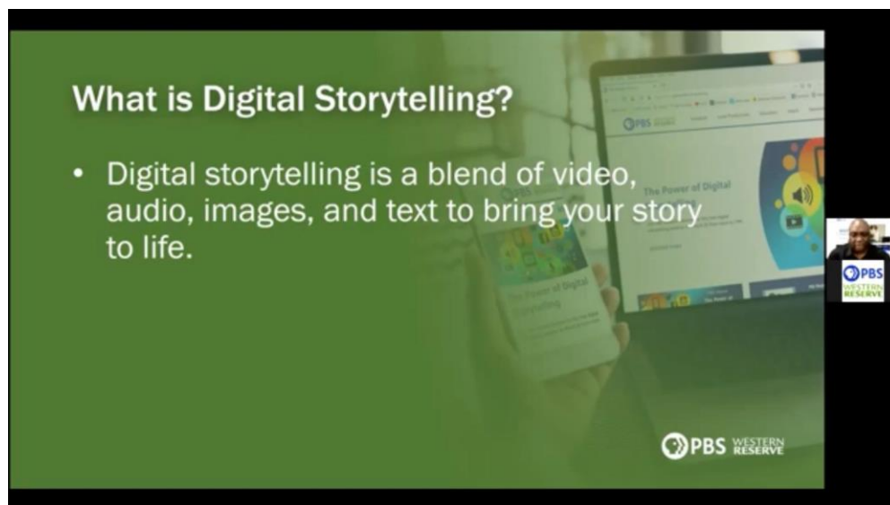
Figure 4.6 Webinar The Power of Digital Storytelling