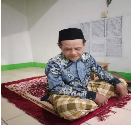
Interview with Tasiri