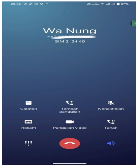
Interview with Nurrohim