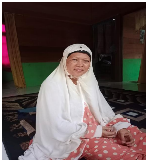
Interview with Toneri