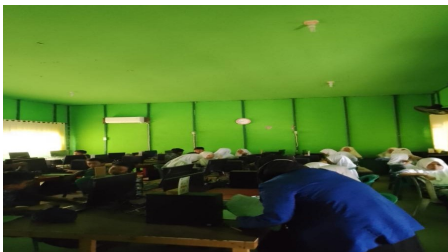
Figure 4.3 Researcher conducted interviews with class VII A students

Based on interviews conducted by researcher with students on Thursday 19 October 2023. Researcher conducted interviews with students about what they thought was that the lessons taught by the teacher was good, as long as the lessons were easy enough to understand. The students said, “Pembelajaran yang di sampaikan bagus saja,cukup mudah untuk di pahami” (F.A, Interview results, October 2023).