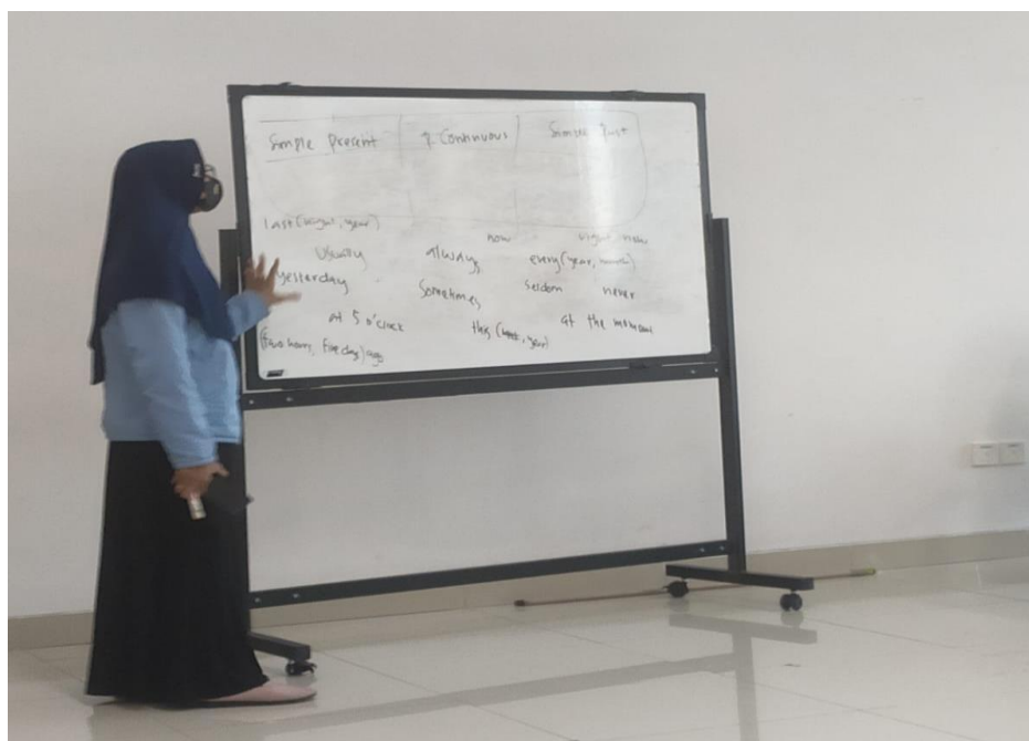
Picture 4.2 The lecturer gave the students a brief explanation about speaking using pictures narrating

This means, that the early activities she did before getting into the teaching activity in her class. The researcher found that the lecturer did associating, experimenting, and communicating. For example, the lecturer gives her students some questions about the material or the story behind the pictures. This one the lecturer did before the students focused on their group assignment and to make sure the students quite understood the task, this one is called questioning.