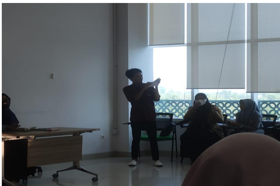
Picture 4.3 The moment when the students did a presentation by using picture narrating.

From the researcher's perspective, this means that the students can develop their speaking skills through the visual media and make them more creative also pushes the students' confidence while presenting their work in front of the classroom. One of the group members did the presentation based on the lecturer giving them time to present their work.