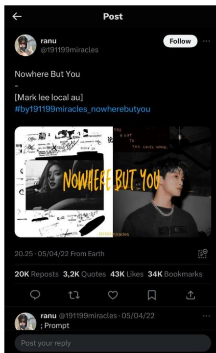
Figure 4.3 P – C Alternative Universe (AU) favorite

The responses from all participants (PA - PC) similarly favor stories in the Alternative Universe (AU) with a romantic genre. Indeed, the romantic genre is a genre pursued and beloved by teenagers in high school. By crafting genres that align with teenage interests, it can enhance students' reading engagement. While using the Alternative Universe (AU), students will be drawn to the genres they enjoy. Additionally, many alternative universe (AU) narratives incorporate or interweave foreign languages within them, such as English, thereby motivating students who read these AUs and helping them understand how English used in the Alternative Universe (AU) can still enable them to comprehend the content of the stories they read.