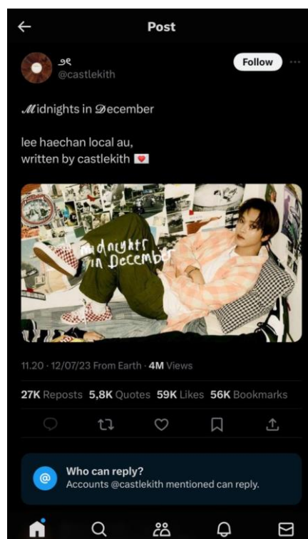
Figure 4.2 P – B Alternative Universe (AU) favorite