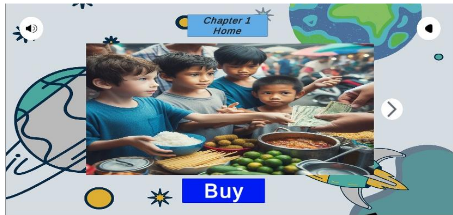
Figure 4.3: Learning Menu Layout

Within each module, students will encounter 15 vocabulary words to learn. Each vocabulary word is presented with audio pronunciation, accompanied by visual images and written descriptions. Navigation through the vocabulary list is facilitated by arrow buttons, allowing students to easily move between entries. Upon completing the module, a button to access the play menu becomes available.