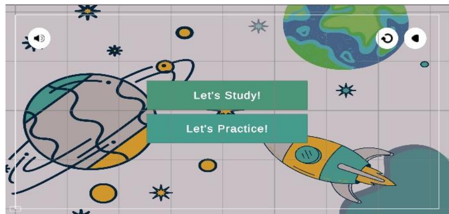
Figure 4.1: Main Menu Layout

This main menu design displays an image from the beginning of the game when the game first starts. In this initial menu there are study, play and exit menus.