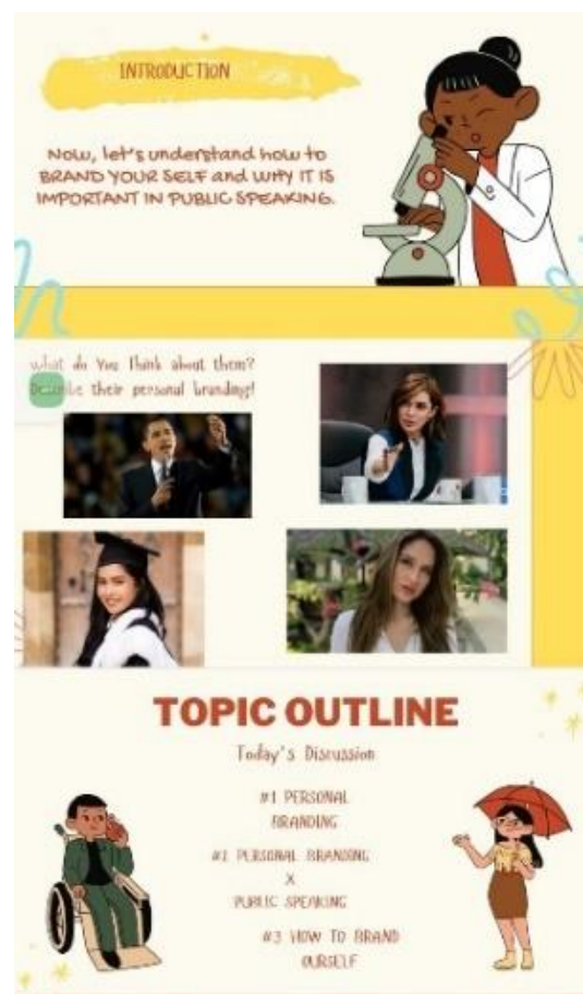
Figure 4. 1 Speaking Material Examples

of access and appeal to students. The use of these materials helps maintain students' interest and involvement and facilitates their understanding through the structured and visual presentation of information. An example of the materials used will be attached below: