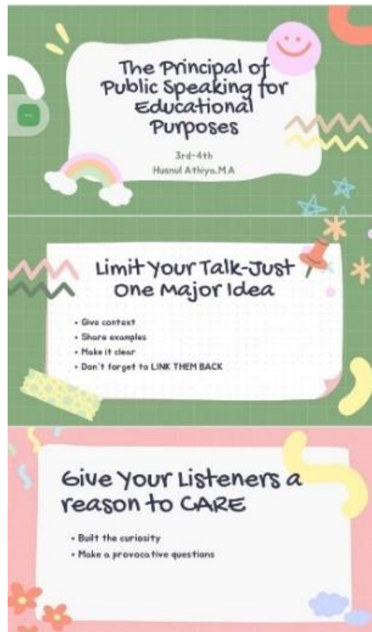
Figure 4. 2 Speaking Material Examples

communication strategies in building and strengthening personal branding. This illustrates how personal branding can help students to differentiate themselves in a competitive work environment.