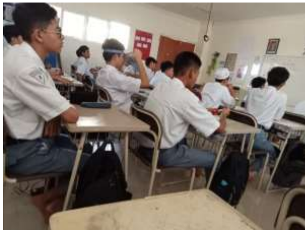
Figure 4.2 English Class Activities in Class X3