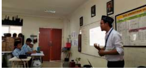
Figure 2.8 English Class Activities in Class XI