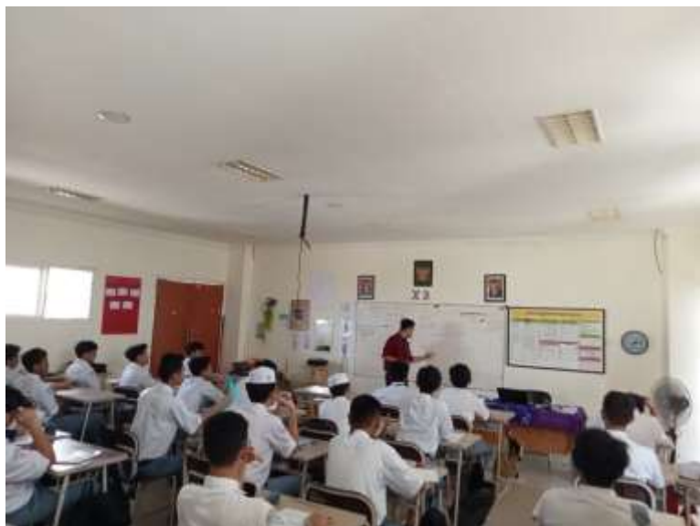
Figure 4.5 English Class Activities in Class X3