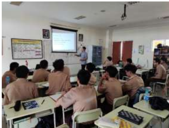
Figure 3.4 English Class Activities in Class X2

The photos taken from P2X2 above have a different meaning. P2X2 explained in detail that there were no difficulties during the photo-taking process, but he needed to find the right time to capture the moment in class. All photo angles used are horizontal from the front and rear angles, showing the preparation for starting class and when learning takes place. Concerning this, this is also in line with the explanation from P2X2 as follows: