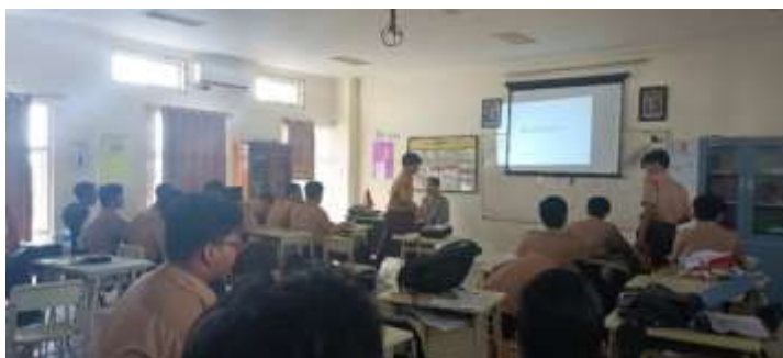
Figure 3.1 English Class Activities in Class X2