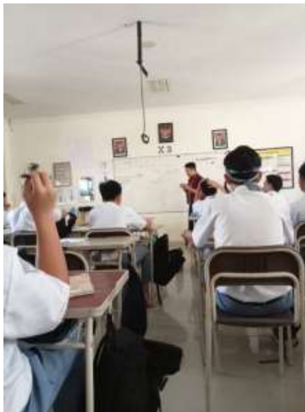
Figure 4.11 English Class Activities in Class X3

Then the last one is the photo results from the P5X3. In his in-depth description, the P5X3 revealed that he found no difficulties during the photo-taking process, and the photo mode he used was a portrait. In this case, P5X3 describes in depth the activities during English class learning as follows: