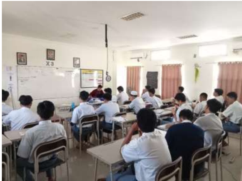
Figure 4.4 English Class Activities in Class X3