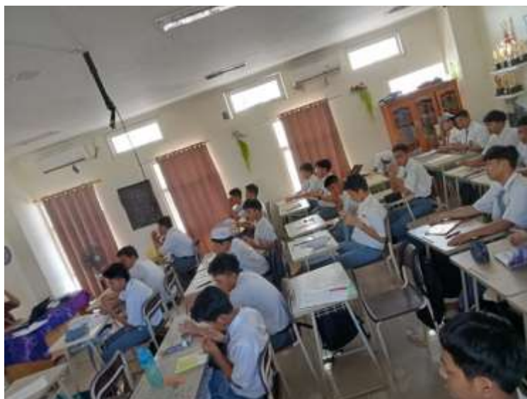
Figure 4.9 English Class Activities in Class X3

Switches to photos from P4X3. As shown in the picture, P4X3 describes the atmosphere of the English class