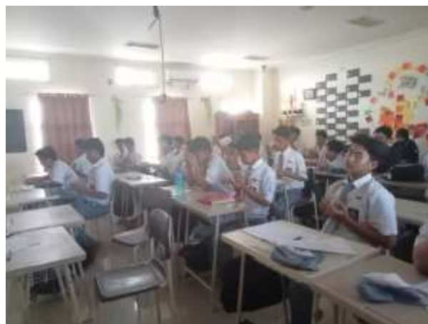
Figure 4.3 English Class Activities in Class X3

Next are the photos taken by the P1X3. As seen above, the P1X3 explains that there were no difficulties during the photo-taking process and the photo angle used; the P1X3 uses landscape mode to get the entire moment in one photo. The three photos presented represent the opening