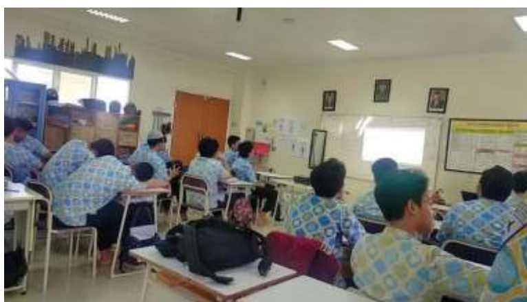
Figure 2.13 English Class Activities in Class XI

The last one is a photo from the P5X1. Based on the photos presented above, the P5X1 revealed that he had no difficulties during photo-taking. The angle of the photo used is landscape, with the reason that all events can be captured in one photo frame. This is also in line with the expression of P5X1 as follows: