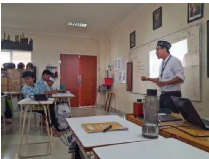
Figure 2.5 English Class Activities in Class XI