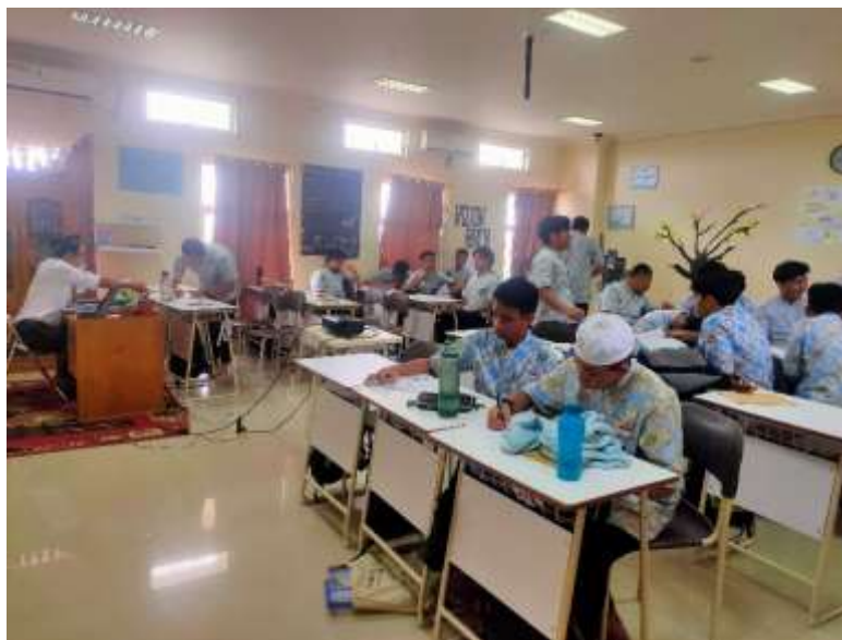
Figure 2.4 English Class Activities in Class XI

Next, the photos above were captured directly by P2X1 in landscape and extended shot modes, showing all the conditions that occurred in class. While taking this photo, P2X1 revealed that he could not take a moment to read the prayer together in class. In the photo, P2X1 briefly and concisely explained how he took pictures like that in order to capture all the moments in one photo. It is also clear that the atmosphere of the English class from the P2X1 point of view represents the concept of independent learning in the independent curriculum, in which the teacher facilitates the material in class, and the children study with other children to find their learning achievements. This agrees with the appearance of P2X1 in the pictures. Then, based on data