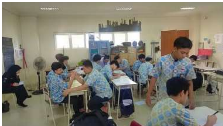
Figure 2.12 English Class Activities in Class XI