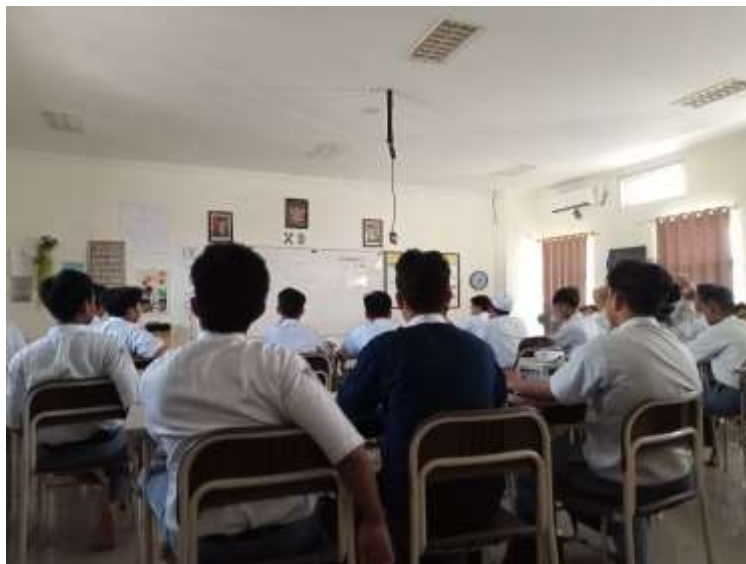
Figure 4.7 English Class Activities in Class X3

The next one is a photo from P3X3. Based on the findings above, he then explained that there were no difficulties while taking photos, especially in the photo mode used by the P3X3, which is landscape, because all the particles and atmosphere are captured in one photo. The reasons explained by P3X3 were similar to the others. However, the researcher found that he researched the conditions around the class very well. This is equivalent to the expression explained by P3X3 as follows: