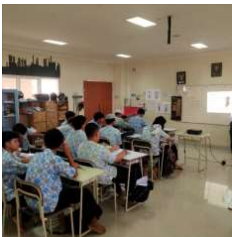
Figure 2.1 English Class Activities in Class X1