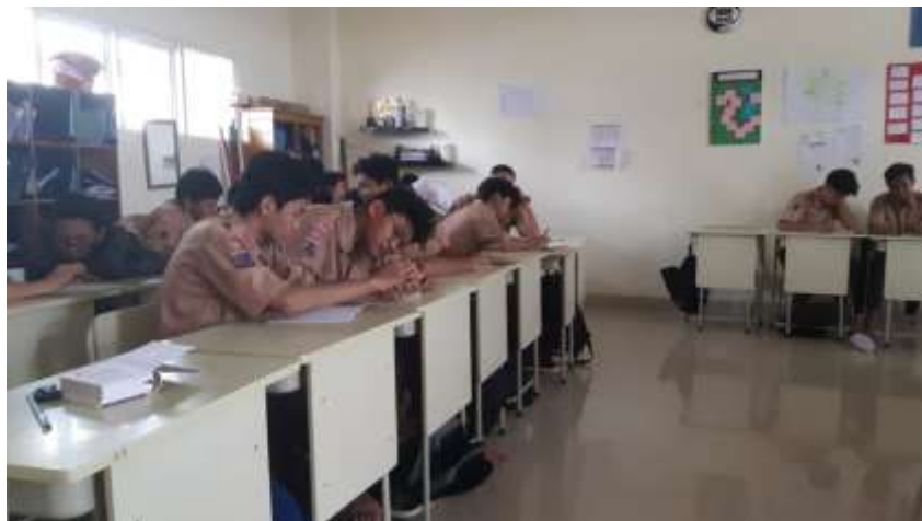
Figure 5. Different Standard of Minimum Completeness of Mastery Learning in class XI

Class XI English is depicted in Figure 5, along with its environment. Figure 5 shows that the students are completing the English teacher's assigned task. After conducting in-depth