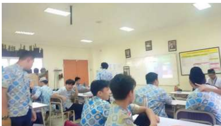
Figure 2.11 English Class Activities in Class XI