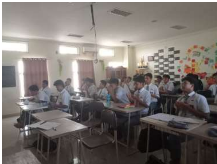
Figure 4.6 English Class Activities in Class X3

Furthermore, like the photos presented above, these photos are portraits from P2X3. P2X3 explained that the photos taken had their meaning, starting from the first photo; he explained that before starting the lesson, there was a group prayer reading session. Continuing with the second photo, P2X3 revealed that the active teaching during the English class resulted in solid chemistry between the teacher and students. And then, in the last photo, after the completion of the lesson, there is a moment captured by P2X3, namely, the class atmosphere becomes controlled.