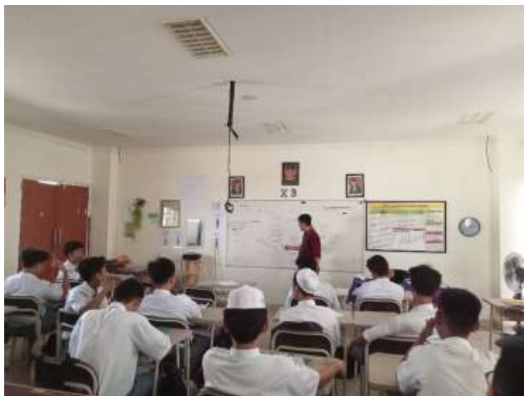
Figure 4.8 English Class Activities in Class X3