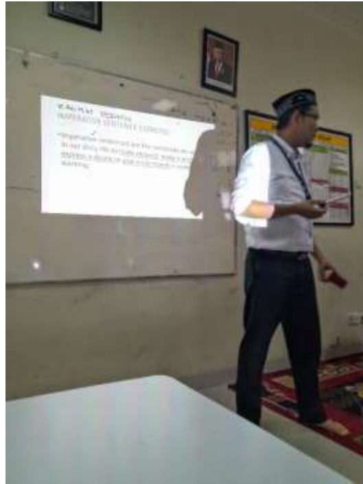
Figure 2.6 English Class Activities in Class XI