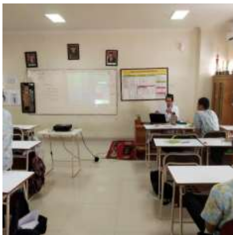
Figure 2.2 English Class Activities in Class XI

P1X1 took the photo above with an angle behind the class, and the photo orientation type is landscape. He stated that at this angle, it would appear comprehensive and precise. While capturing this moment, P1X1 revealed a few difficulties encountered, such as finding the right moment, and several students prevented him from taking pictures of the English class atmosphere. He also revealed that there were five times in the process of taking photos; however, according to P1X1, the photo above was the best. Based on the photos that have been collected, P1X1 describes them as follows.