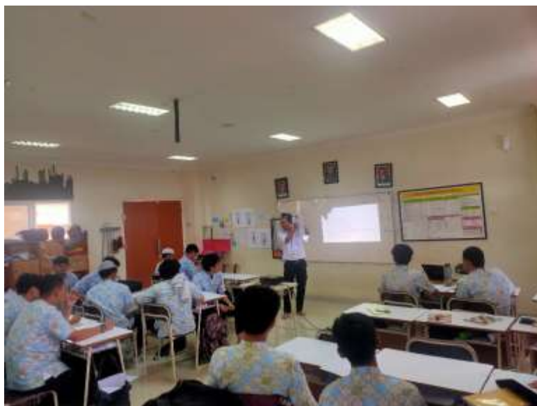
Figure 2.3 English Class Activities in Class X1