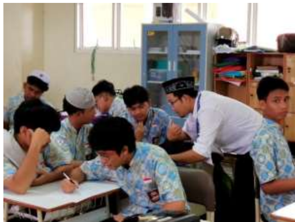
Figure 2.9 English Class Activities in Class XI