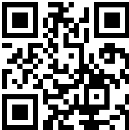
Figure 4.5. The QR Code of the video containing the audio produced by TTS that was uploaded to YouTube.com

the classroom without the teacher having to interact with it often. The listening materials that had been created by the teacher can be examined here: